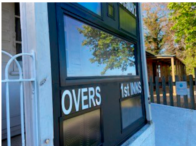
Ringmer Cricket Club

It is important to report on developer contributions which help local communities, and for developers to see how contributions have been spent and understand what future funds will be spent on, ensuring a transparent and accountable system. This report has been prepared with reference to the CIL Regulations 2010 (as amended) and the Planning Advisory Service guidance.