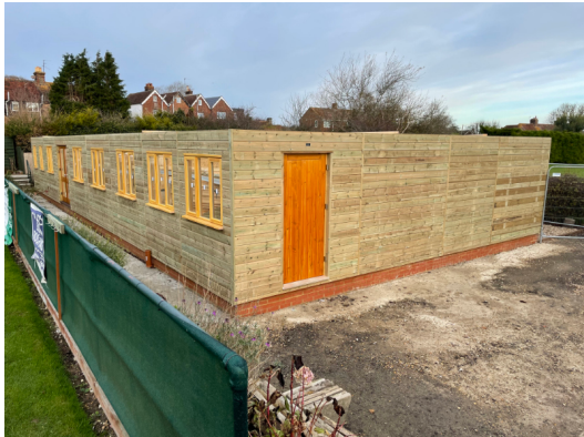
Ringmer Bowls Club

CIL is intended to focus on the provision of new infrastructure and should not be used to remedy pre-existing deficiencies in infrastructure provision unless those deficiencies will be made more severe by new development. It can, however, be used to increase the capacity of existing infrastructure or repair failing existing infrastructure, if it can be demonstrated that these works are necessary to support new development.