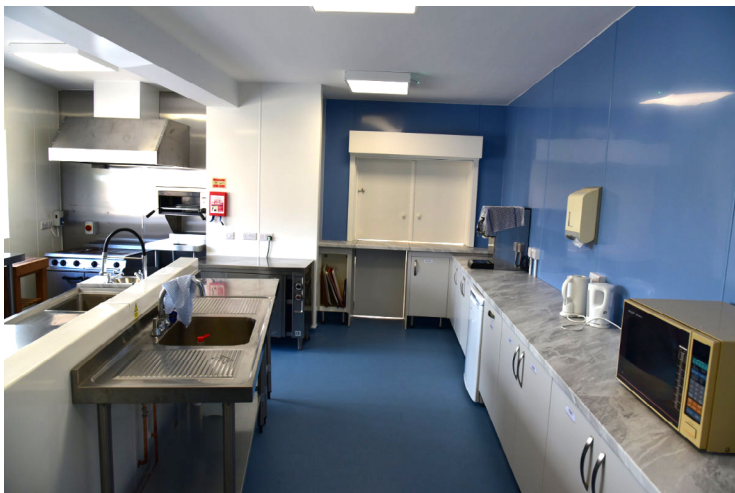
Ringmer Village Hall Jack Hart Kitchen