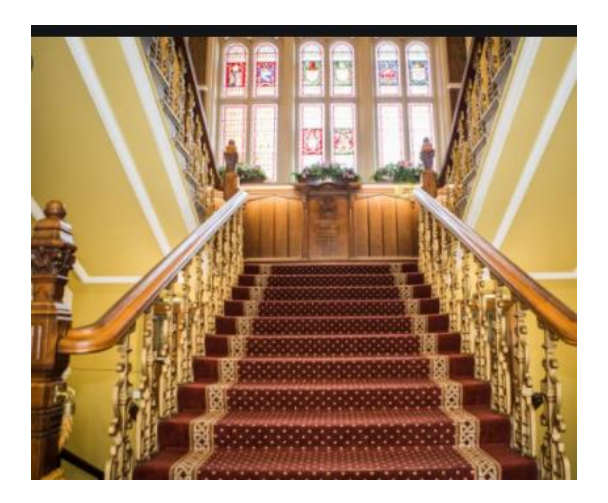
Figure 6 Main staircase

Where the stairs divide there is a handrail to the balustrade on both sides with the flight on the left also having a handrail on the wall.