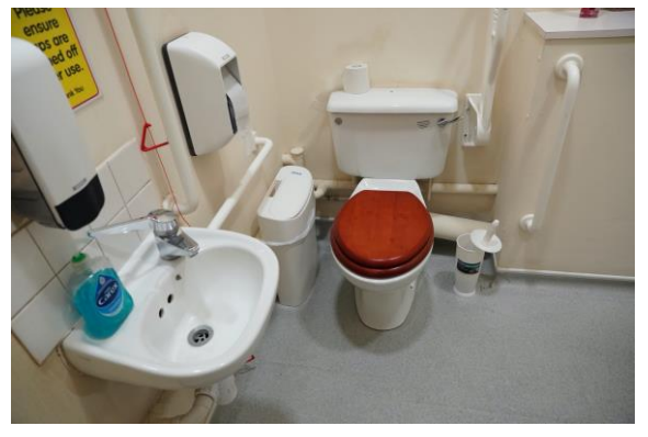
Figure 10 Accessible toilet