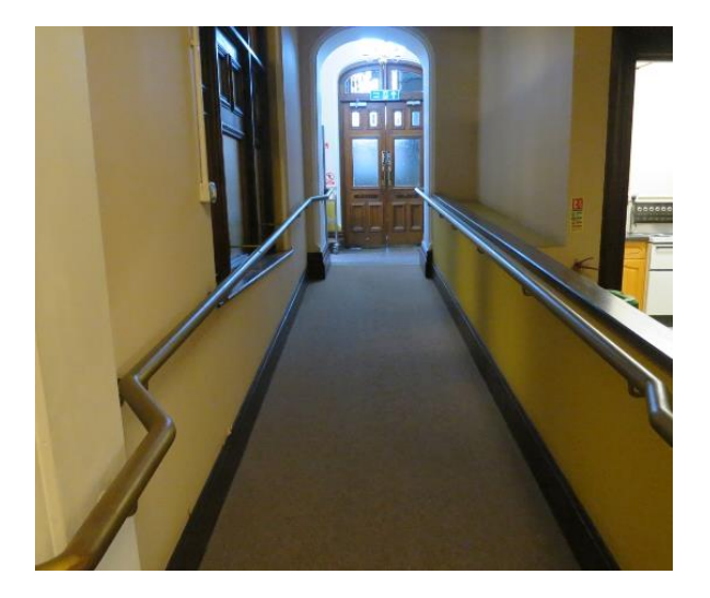
Figure 7 Ramp leading to the Court Room