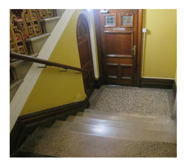
Figure 8 Steps to male toilets

There are no outward opening cubicles or support rails.