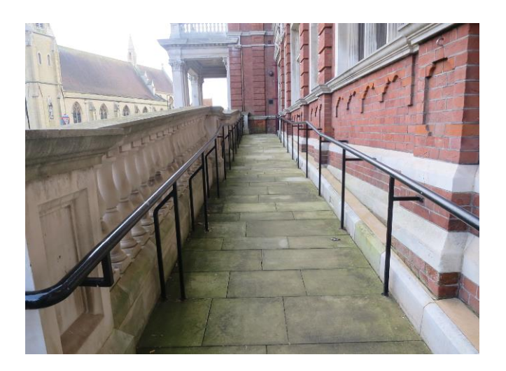
Figure 3 Ramp to main entrance

The ramp takes you to outer doors that are held open and inner doors that are sliding and powered. You will find yourself at the Reception Desk.