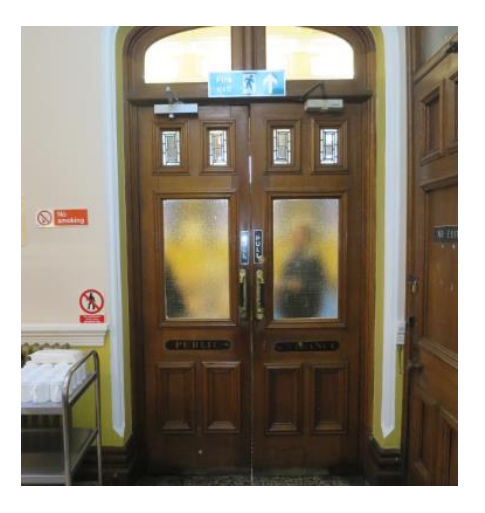
Figure 5 Example of a double door, specifically, the door in the image is the entrance to the Court Room

Door handles are above 1000 mm and some have round twist knob handles.