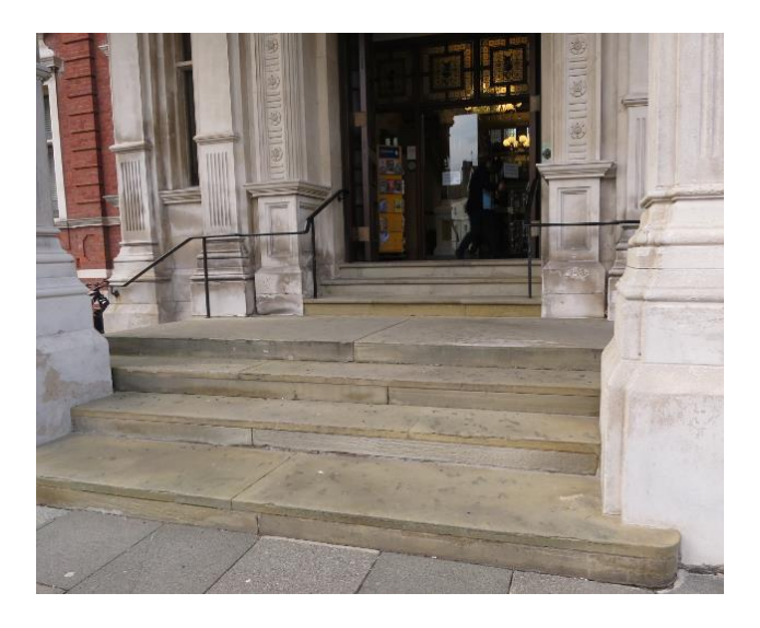
Figure 2 Image of steps to main entrance

They take you to large wooden doors, which are held open, and then glass lobby doors. You turn right to reach the reception. This is signposted.