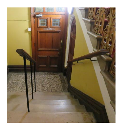
Figure 9 Steps to female toilets