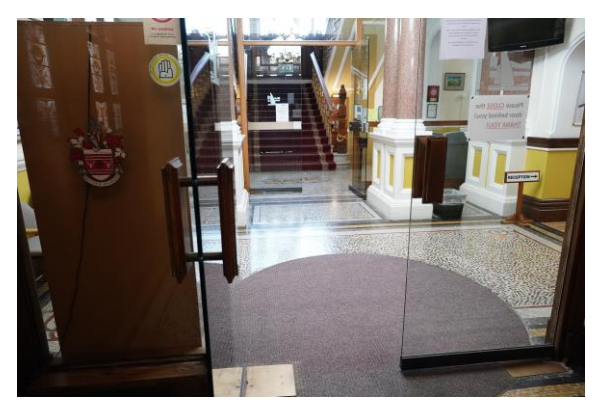
Figure 4 Glass doors out of the reception area

The floor is old and has a mosaic pattern and dark border that might be confusing to some people.