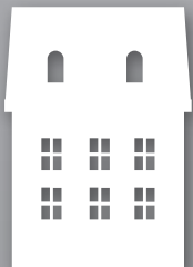
Western Road, Newhaven (top) Ashington Gardens, Peacehaven (bottom)