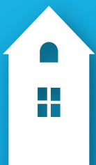
Stowe Place and Mews, Newhaven