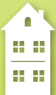
Palmerston House, Newhaven