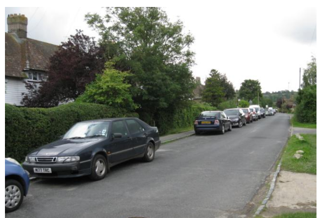
On-road parking in The Forges, a 2005 market housing development, and on Harrisons Lane, a 1930 development for Glyndebourne Estate employees, on a bus route that also serves Ringmer Primary School.

4.6.4 In October 2012 new guidance was issued by East Sussex County Council on the provision of car parking and secure bicycle parking in new residential development. This takes a flexible approach, in accordance with NPPF paragraph 39, and provides a tool to calculate parking requirements at new developments that reflect local need. Unfortunately the tool provided depends either on ward or superoutput area data, both of which link Ringmer to very different rural communities with different levels of car ownership and use and (in some cases) very different public transport facilities. We are not aware of any evidence at the sub-parish level to suggest that car ownership and use is different in different parts of Ringmer parish. The parking provision proposed for new development in “Ringmer to 2030” takes a parish-wide approach, and also makes allowance for the lower level of car