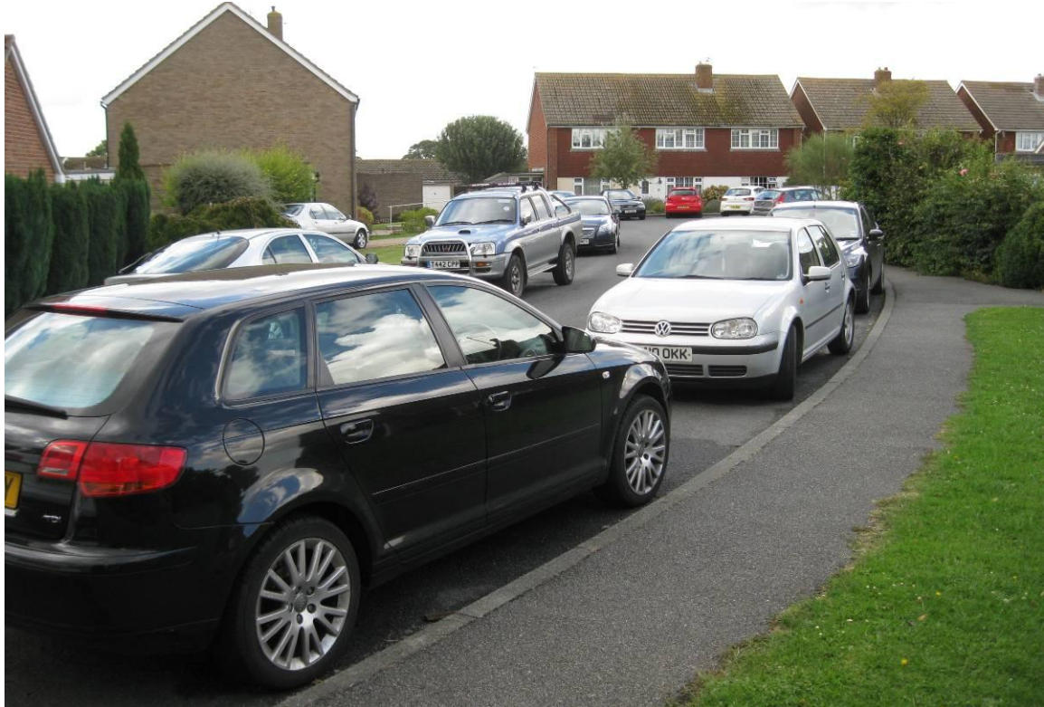
On-road parking in Turnpike Close, a 1960s market housing development in the Broyleside

On-road parking in Vicarage Way, an occasional bus route in the Ringmer Green Conservation Area. Damage to the kerb & verge can be seen on the right, caused by heavy vehicles leaving the carriageway to pass parked vehicles.