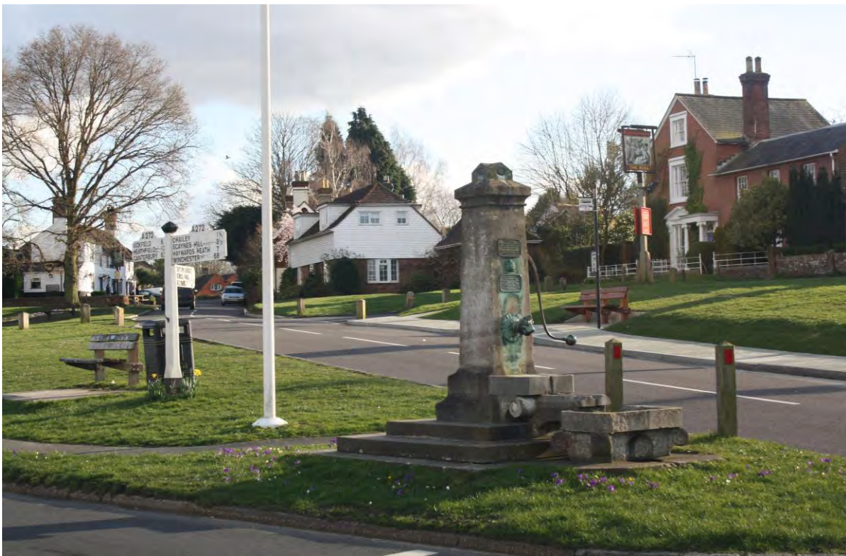
Approved by Newick Parish Council 16 th December 2014

Without the assistance of those mentioned above, there would be no Neighbourhood Plan and no opportunity for its adoption. That would have left no local influence on the location, type, size or appearance of Newick's new housing.