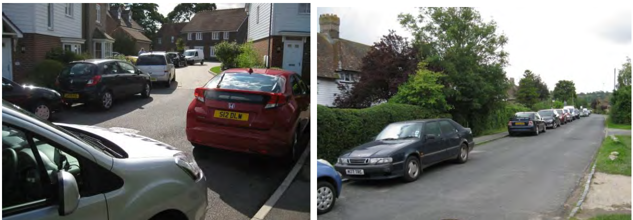
On-road parking in The Forges, a 2005 market housing development, and on Harrisons Lane, a 1930 development for Glyndebourne Estate employees, on a bus route that also serves Ringmer Primary School.

4.6.4 In October 2012 new guidance was issued by East Sussex County Council on the provision of car parking and secure bicycle parking in new residential development. This takes a flexible approach, in accordance with NPPF paragraph 39, and provides a tool to calculate parking requirements at new developments that reflect local need. Unfortunately the tool provided depends either on ward or superoutput area data, both of which link Ringmer to very different rural communities with different levels of car ownership and use and (in some cases) very different public transport facilities. We are not aware of any evidence at the sub-parish level to suggest that car ownership and use is different in different parts of Ringmer parish. The parking provision proposed for new development in “Ringmer to 2030” takes a parish-wide approach, and also makes allowance for the lower level of car