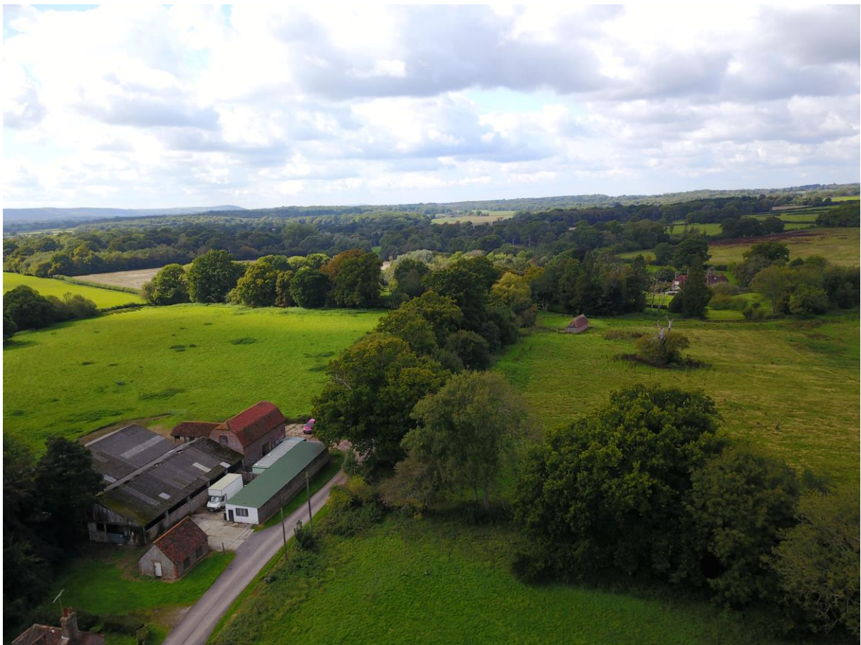
Figure 11: East of Chailey Green towards The Moat