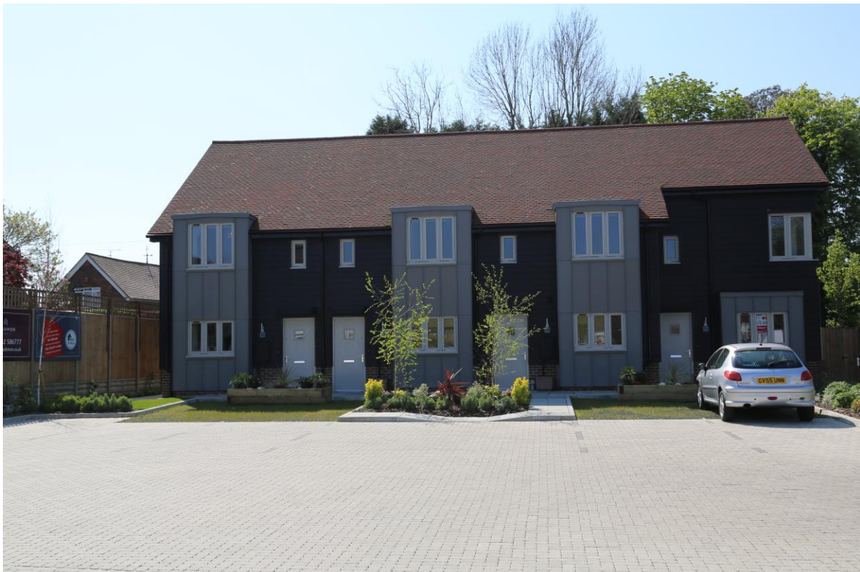
Figure 20: Part of recent King's Head development - a mix of small flats and 2-3 bedroom apartments in the Sussex Barn style

Key Evidence base reference: Historic environment report, Character appraisal, Housing Needs Survey, Shaping Chailey Questionnaire, Local connection eligibility for affordable housing criteria as required by Lewes & Eastbourne