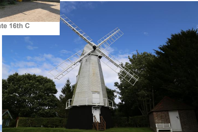
Figure 3: Chailey Mill - geographical centre of Sussex