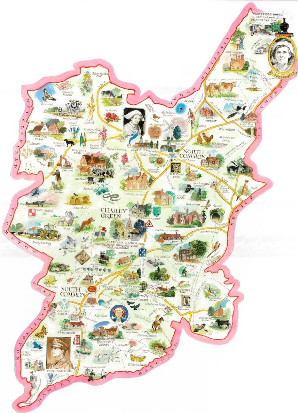
Figure 19: Chailey history