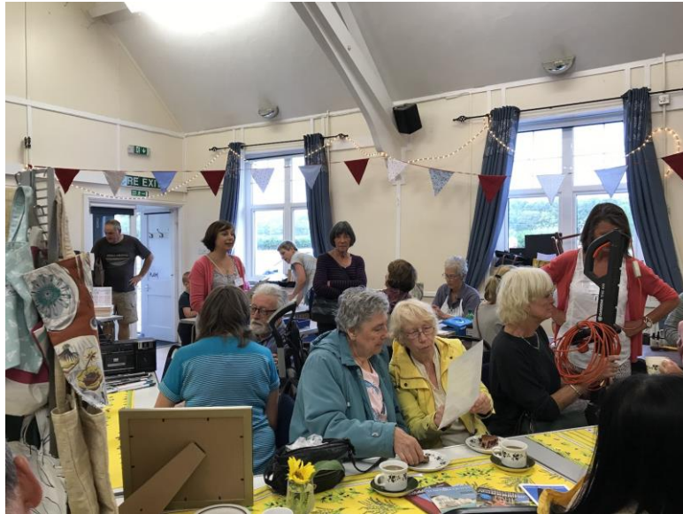
Figure 15: Repair café