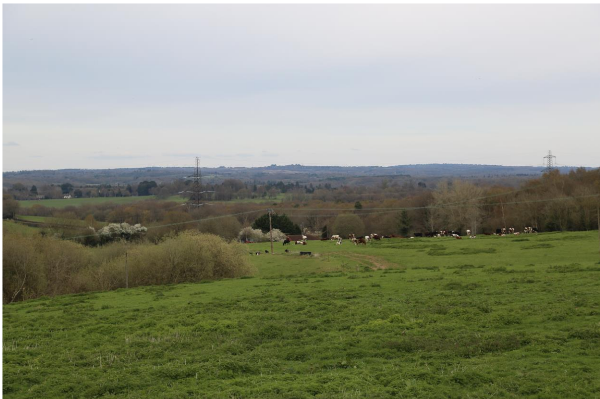
Figure 21: Farmland to the North across the Ouse Valley and on to the Ashdown Forest

Key Evidence base reference: Survey, national guidance from Natural England, Natural England website SSSI Mapping System impact risk zone. Local planning authorities have a statutory duty under Section 28G of the Wildlife and Countryside Act 1981, as amended, to avoid damage to SSSIs and to further their conservation and enhancements.