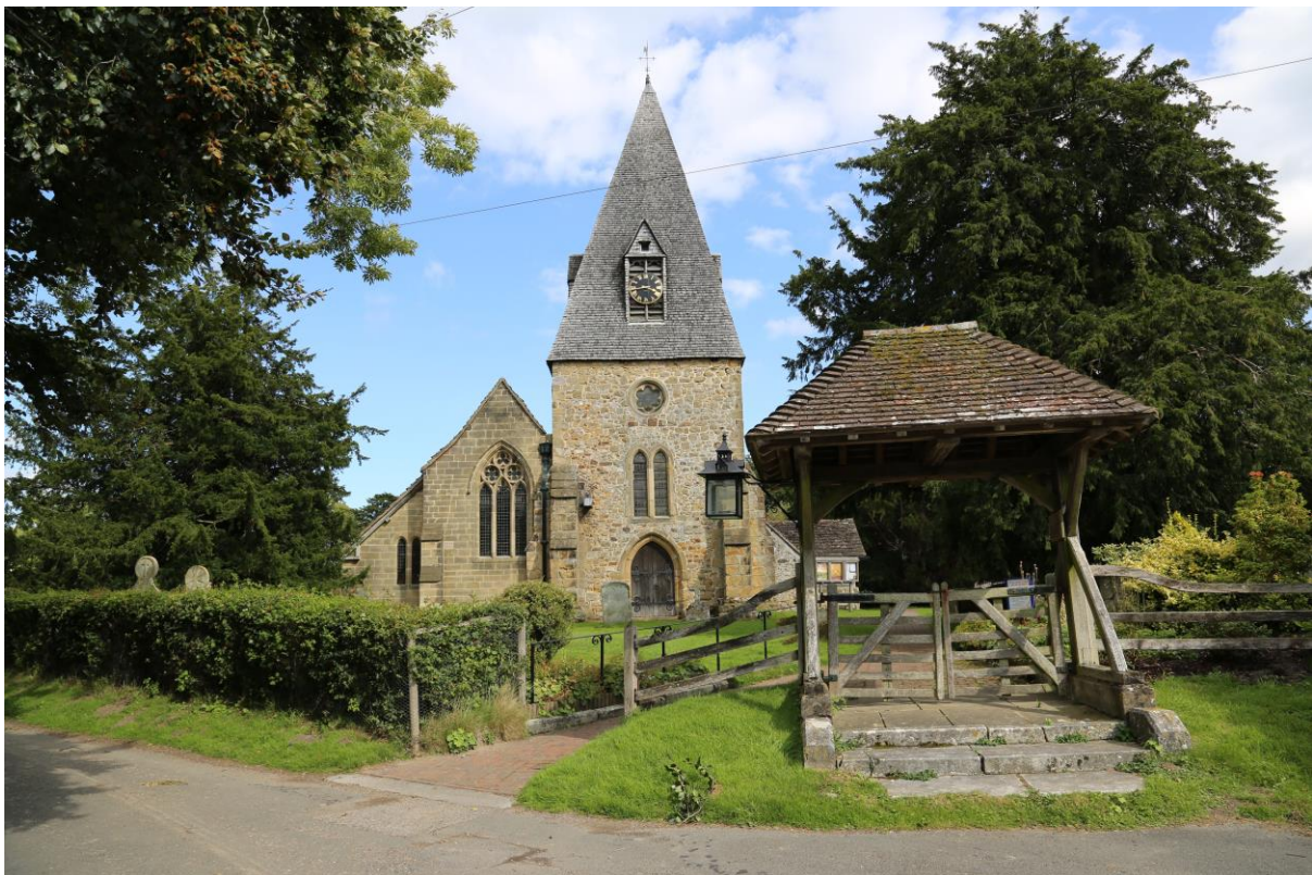
Figure 7: Chailey Church and Lychgate

The historic centre of Chailey includes Chailey Green, Cinder Hill and Cornwells Bank, connected by the A-275 and the Cinder Hill road. These roads appear on the first road Atlases of England in the late 17 th and early 18 th Century by Ogilby, Senex and Owen & Bowen, which all mark the centre of Chailey at this point. Chailey Green is the historic centre of the parish as evidenced by the 13 th Century Church and deserted medieval house plots stretching west towards Chailey Moat, a suggested medieval moated site. The Green to the north of the Church formerly housed small businesses including a butcher, a general stores, a tailor, a smithy, a cobbler, a carpenter and others during the 19 th and early 20 th Centuries. The Green now forms a Conservation area centred on St Peter's Church and the Parish Office and Reading Room. Larger houses and farmsteads (many being listed dwellings) from earlier centuries to the present, have developed along lanes to either side of these roads and more specifically in 'closes', effectively lanes off the central spine of the A-275 and the A-272.