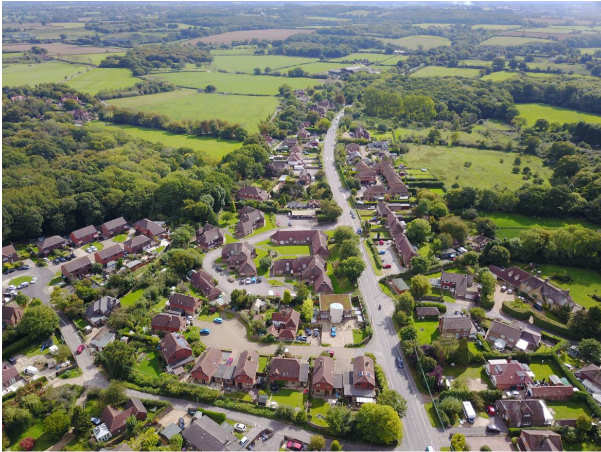
Figure 5: Panorama of South Common settlement looking South – note the pattern of Closes which lie off the main A 275 highway