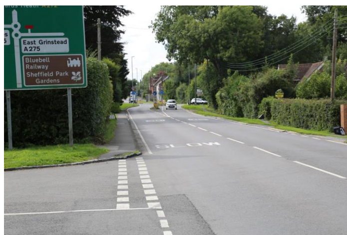
Figure 23: A 272 near King's Head Cross roads. Here houses lie well back from the main A 272 highway through the Northern part of the village

Key Evidence base reference: Shaping Chailey Questionnaire