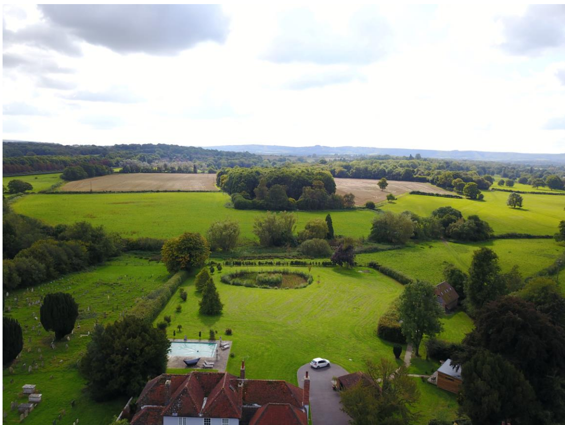
Figure 14: South from St Peter's Church

The Bluebell Business Park in North Chailey is home to a number of small businesses which include joiners, tool suppliers and a microbrewery, among others.