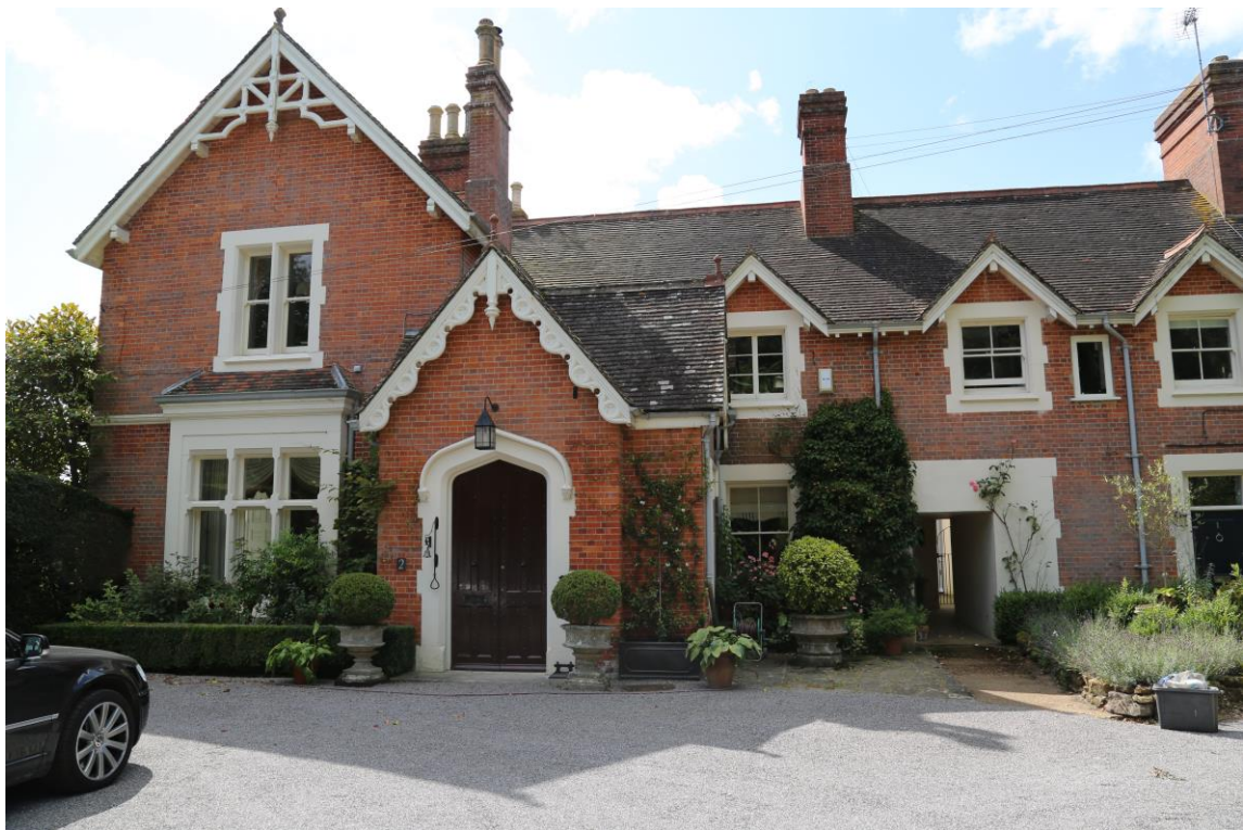
Figure 17: Roeheath

There are many historically significant buildings in Chailey, more than fifty of which are protected from demolition and inappropriate alteration by their designation as Listed Buildings, because of their architectural and/or historical importance and are graded II or II*. The historically significant buildings, including listed buildings, are identified in the Character Appraisal Document, and their locations are shown in Map 16 of Annex 1.