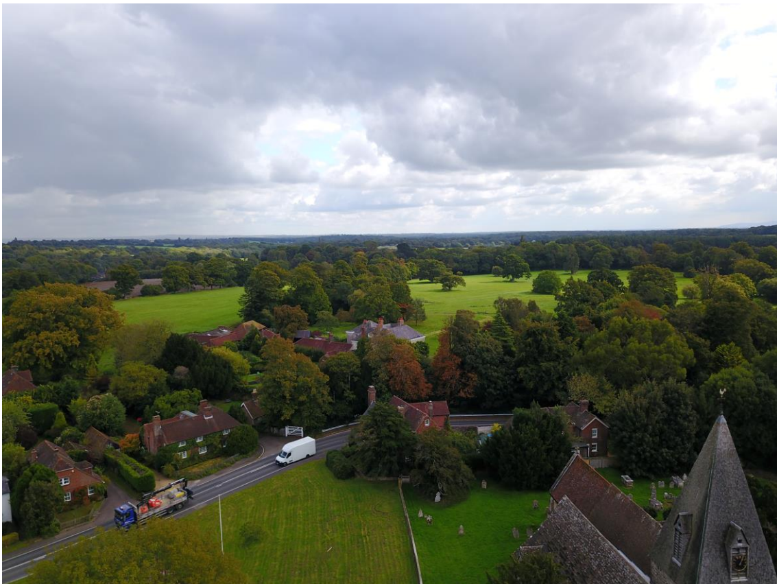
Figure 13: South West from Chailey Green