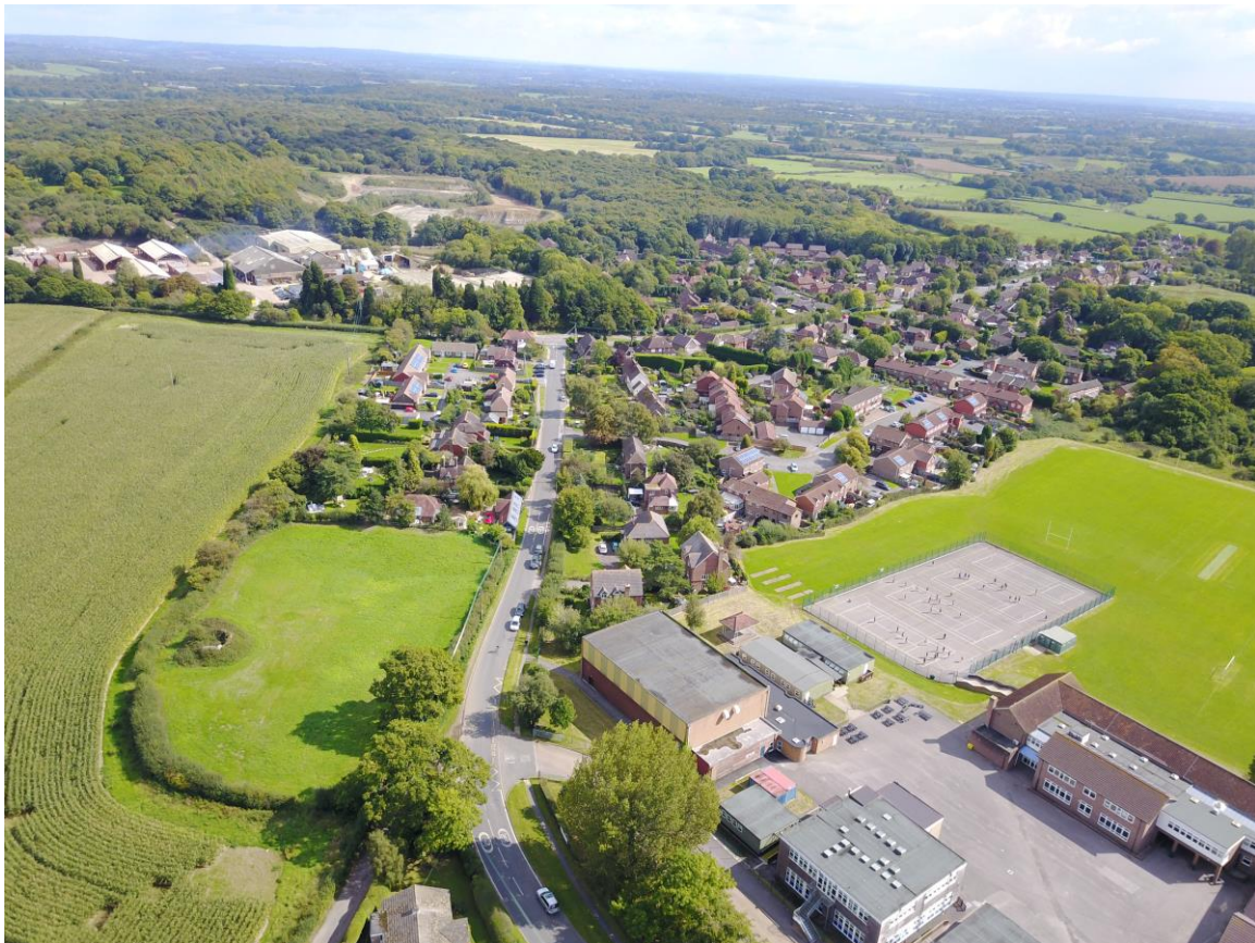
Figure 24: Mill Lane, South Common, showing Chailey Secondary School and the Brick Works beyond