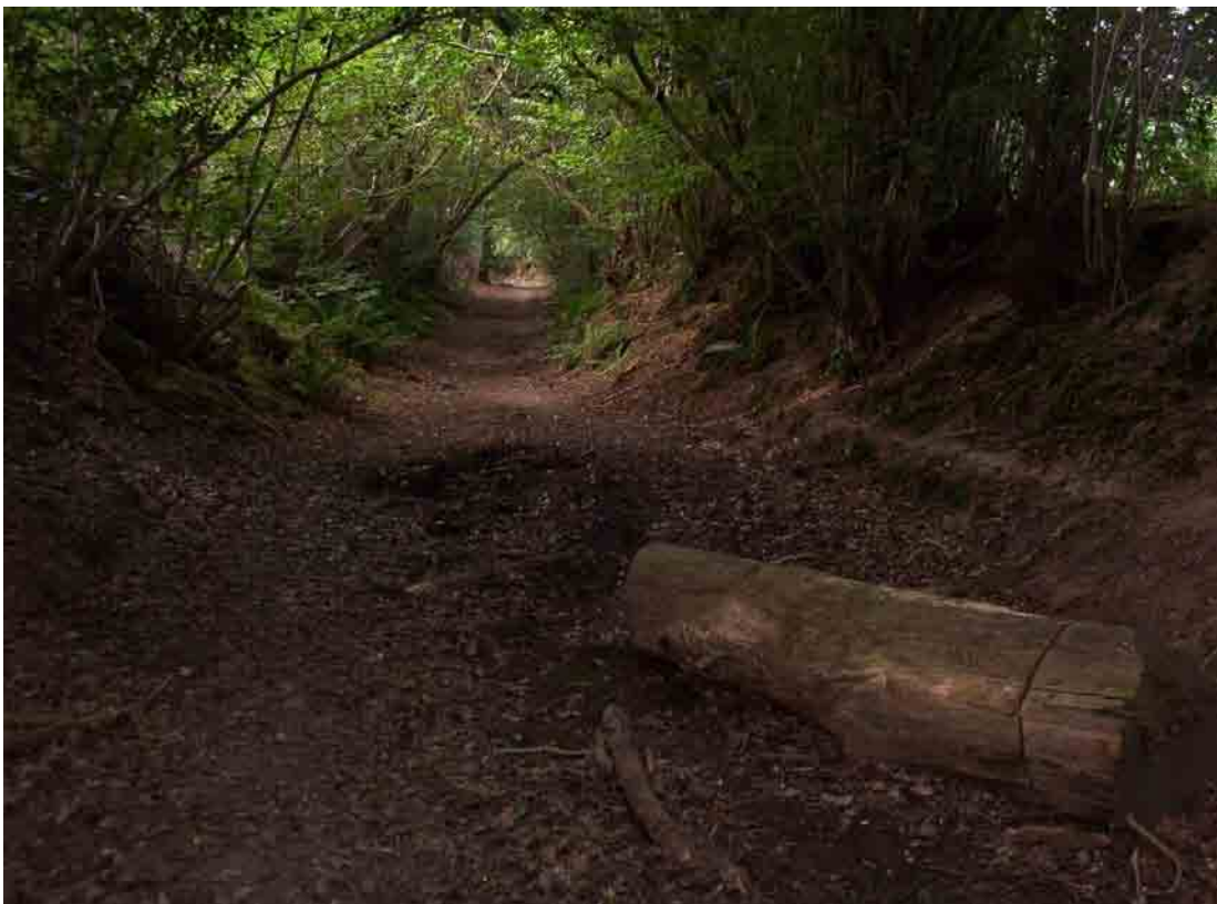
Figure 18: Cockfield Track, an ancient holloway to the east of Chailey

The approach of the Neighbourhood Plan Task Group has been to take into account residents' comments, but, also, to make a study of a number of recent developments and to highlight the good and “less good” aspects of each (appraisals in appendices). The lessons learnt have been incorporated into the policies on design and appearance in the NP.