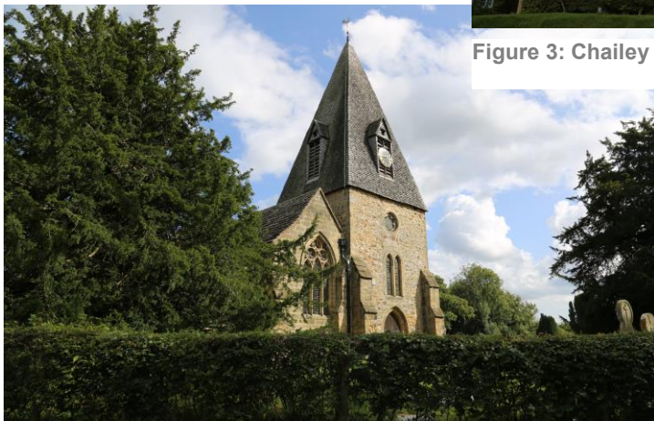
Figure 4: Tower of St Peter's Church at Chailey Green - 13th C