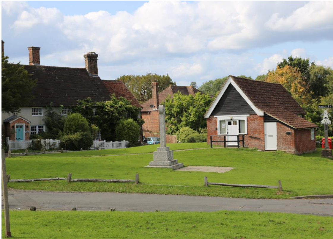
Figure 12: Chailey Green - the centre of the village