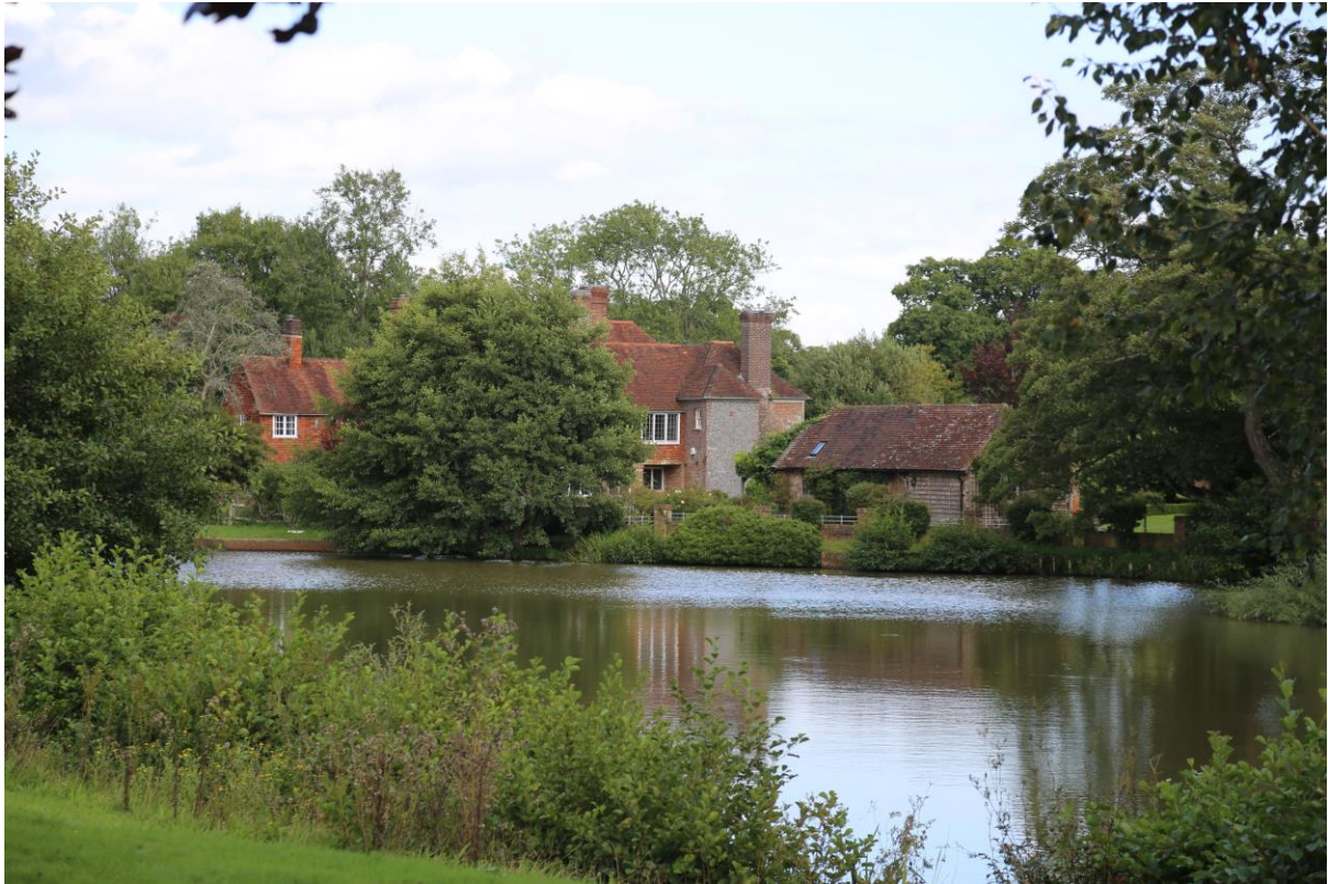
Figure 8: Chailey Moat