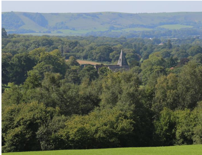
Figure 1: Vista to the Downs from above Roeheath across the village centre