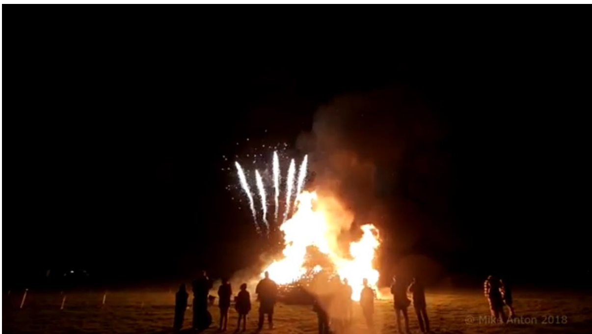
Figure 22: Annual Chailey Bonfire Celebration

Key Evidence base reference: Survey, The Assets of Community Value (England) Regulations 2012