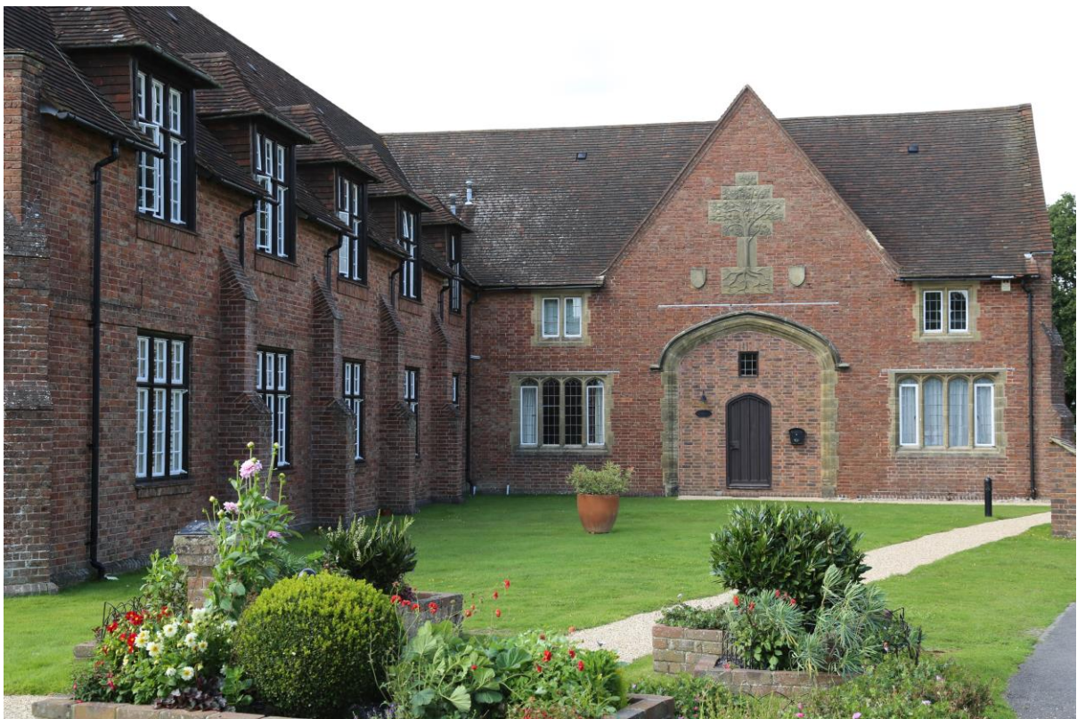
Figure 9: St. George's Development (1932) with the Golden Apple Tree relief commemorating the campaign to raise funds to build this part of Chailey Heritage, now converted to 14 flats and maisonettes