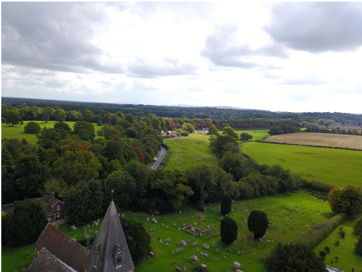
Figure 6: Vista of Chailey between The Green and South Common