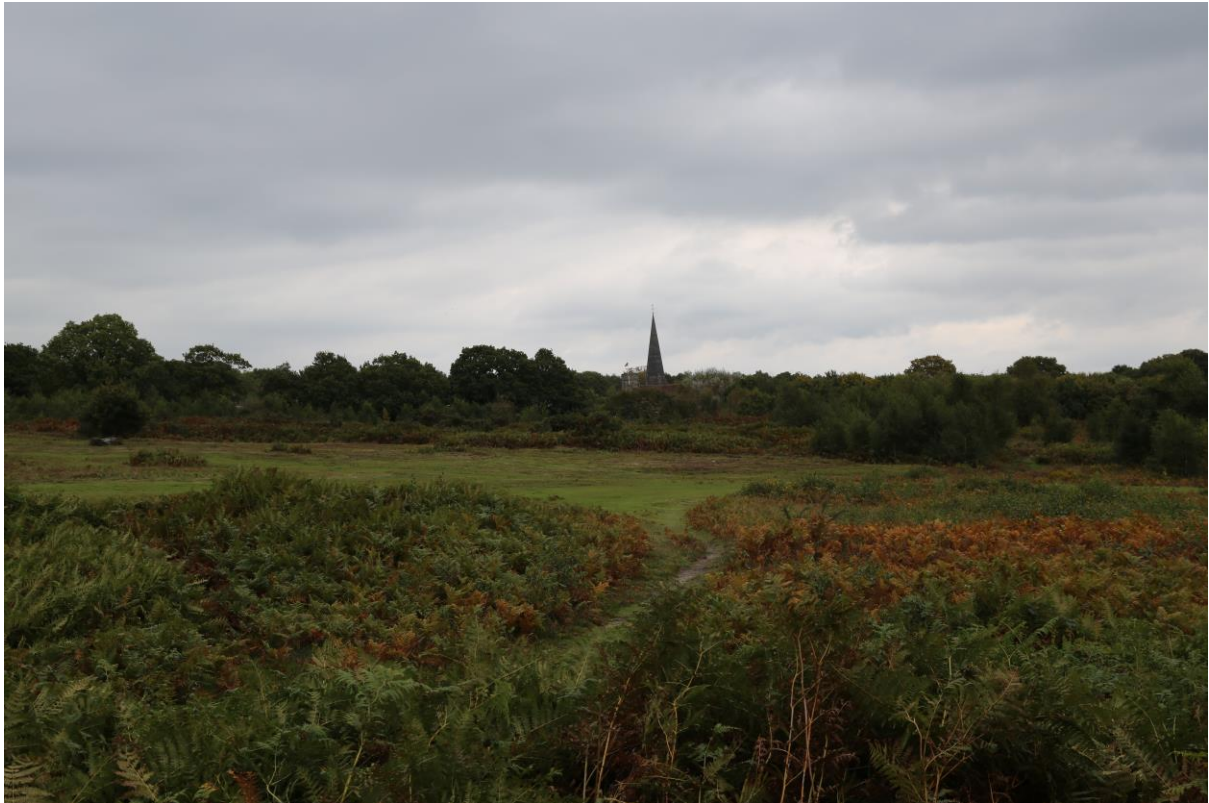
Figure 10: Spire of St Martin's Chapel - part of Chailey Heritage - seen from Romany Ridge, one of the five Commons making up Chailey Common