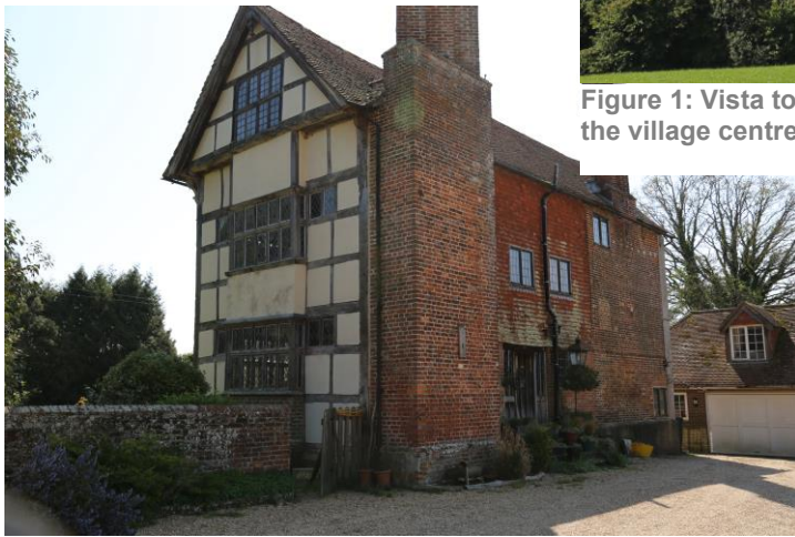
Figure 2: Wapsbourne Manor Farmhouse - late 16th C