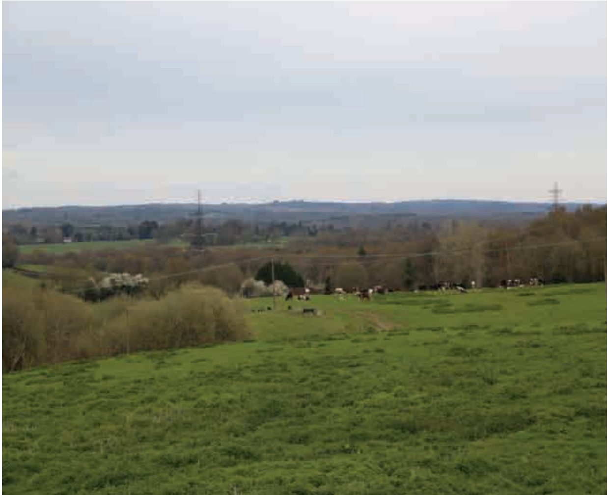
View from Banks Road North across Ouse Valley