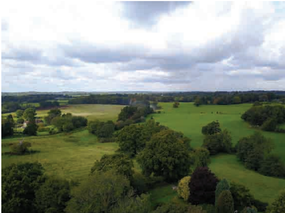
Typical Landscape surrounding Chailey Green

20 The surrounding landscape character is influenced by several distinguishing features, including relatively small, irregular fields; parcels of small to medium sized woodland areas; and (remnant) heathland and common land. Chailey Common (a designated SSSI and Local Nature