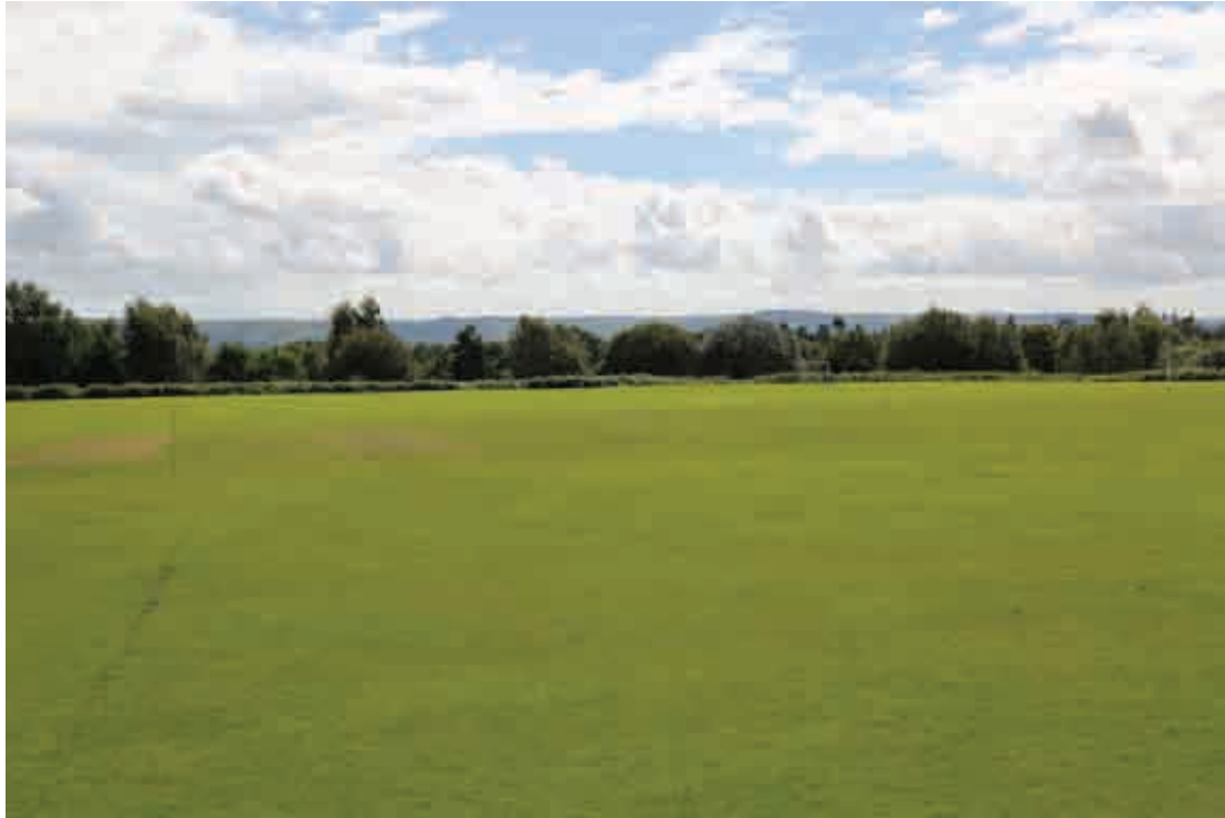
Chailey Sports Ground, with its iconic view to the Orion Dark Skies viewpoint on the Downs

10 Head cross roads. This area is managed by the Chailey Sports Club. It offers opportunities for young people to become involved in organized team sports such as football, hockey and cricket, and is home to Chailey Colts and Chailey Cricket Club (founded 1758).