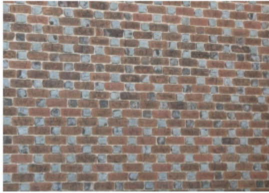
Appearance of wall using Vitrified Headers