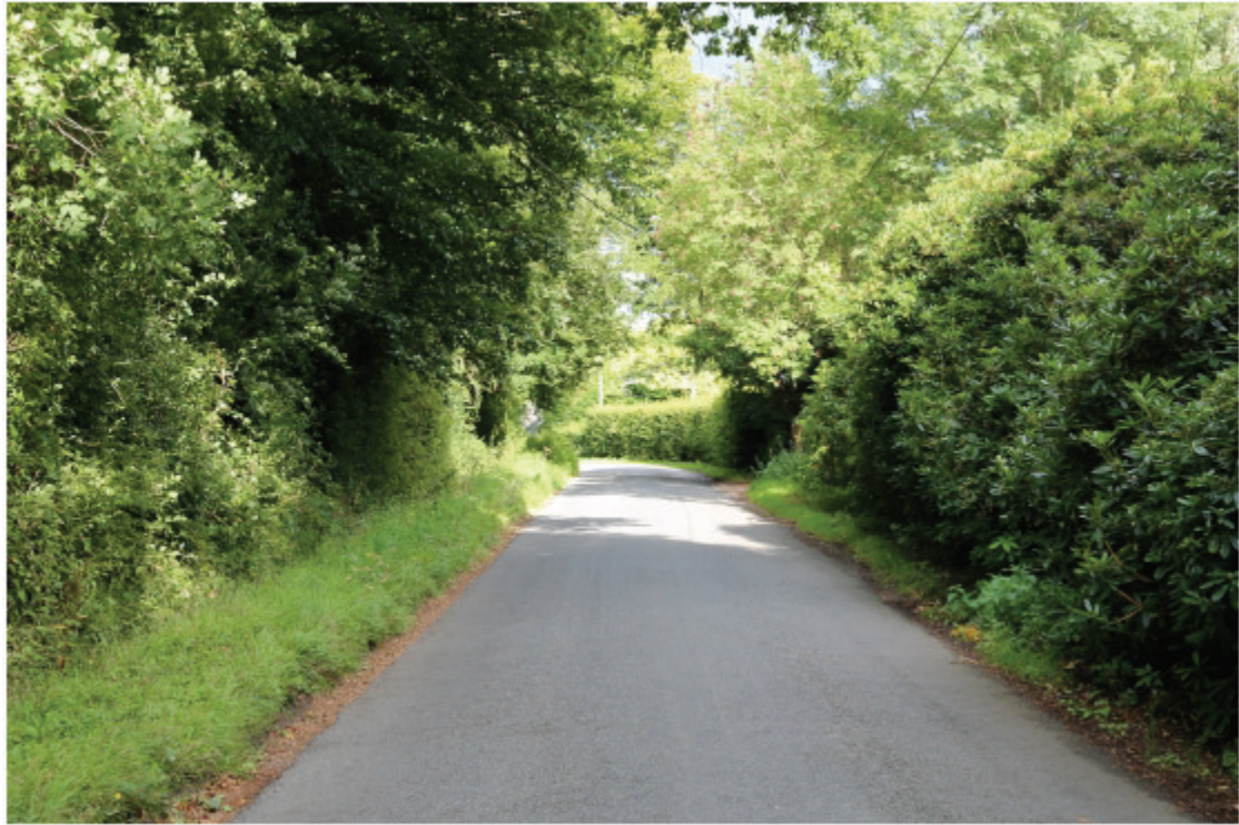
Start of Cinder Hill at its Southern End

The lane is located on a slight ridge with the southern side raised and gently sloping down to the north. The immediate surrounding countryside is softly undulating.