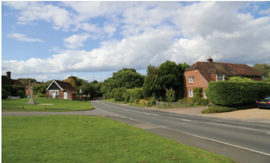
Chailey Green looking North