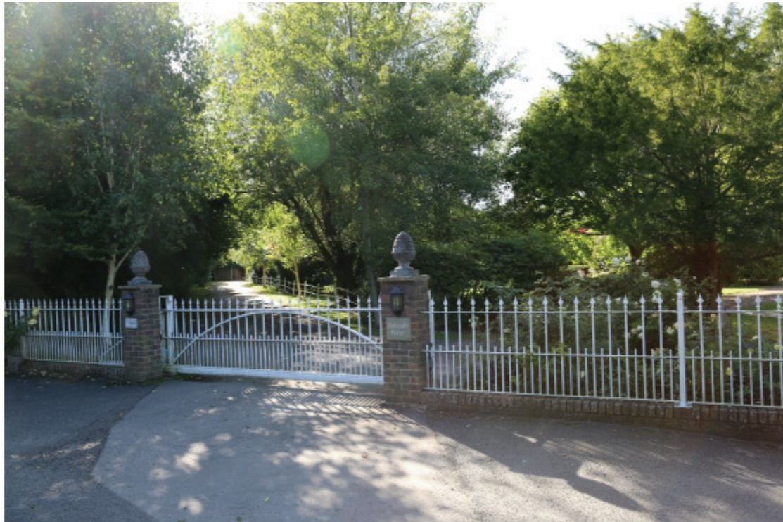
Balneath Manor – Entrance Gates

Listed Buildings, and other buildings of historical and/or architectural interest, should be preserved and conserved and not affected by adverse alterations, including inappropriate additions in the curtilage or within their setting.