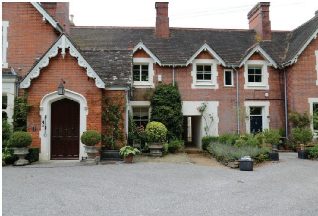
Roeheath – Main Entrance

There are many historically significant buildings in Chailey, some of which are protected from demolition and inappropriate alteration by their designation as Listed Buildings, because of their architectural and/or historical importance and are graded II or II*. The historically significant buildings, including listed buildings, are identified in Appendix 1.