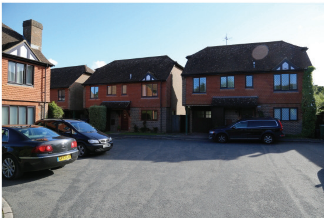
Typical Houses at Swan Close