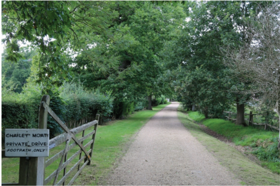
Approach to Chailey Moat