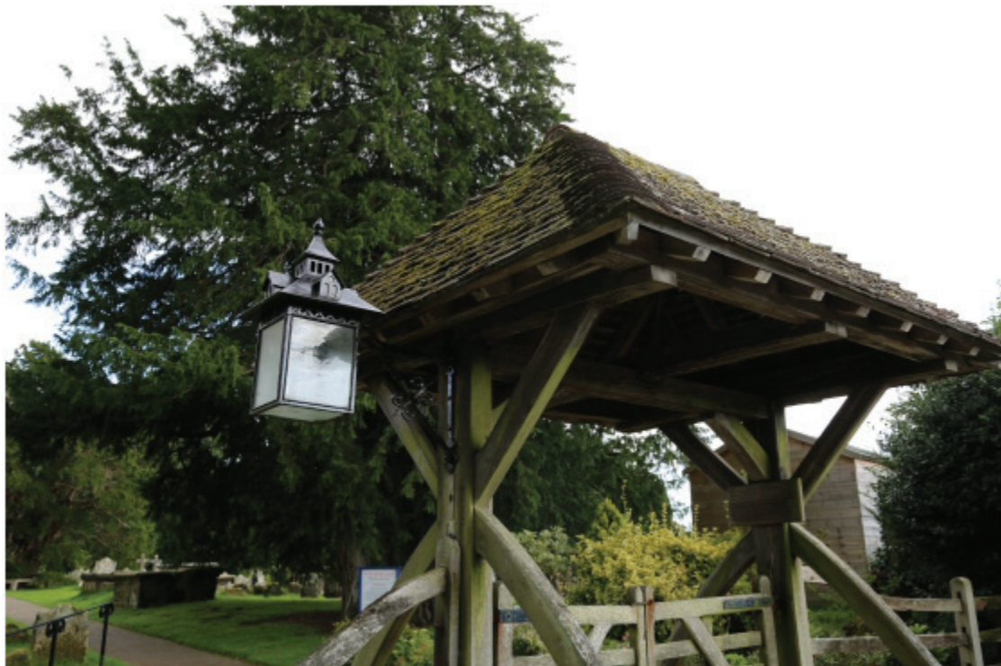
Lychgate of St Peter's Church, with ancient yew, the centre of Sussex

The name Chailey is thought to derive from the Saxon word “chag” which referred to the gorse and broom which grew in the area. The area's name has evolved, during the late 11th Century and early 12th Century when it was known as Chagleigh, and prior to the 17th Century as Chagley. The oldest standing building in the conservation area is St. Peter's Church, part of which dates from the 13th Century.