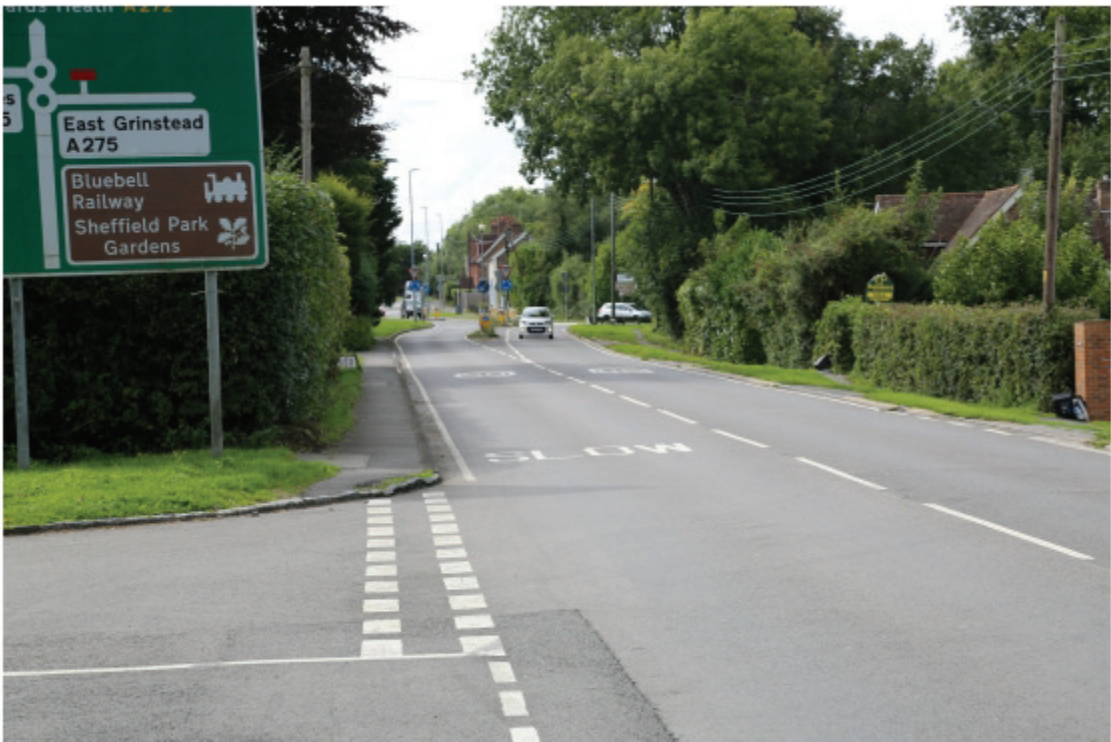
The A-275 near the King's Head Crossroads