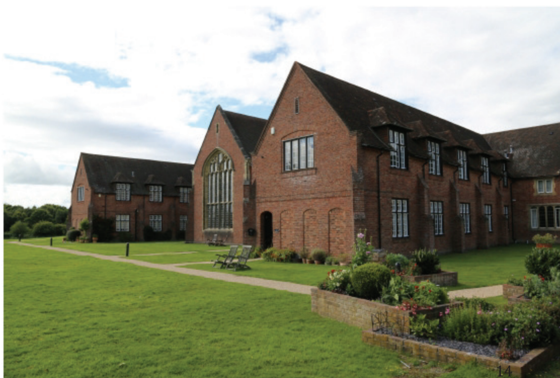
St George's Building with Chapel

St George's Conservation Area is located nine miles north of Lewes, to the north west of North Common. The site lies within Red House Common, which is part of Chailey Common Local Nature Reserve. Chailey Common, one of the largest heathland commons in southern England, is also a Site of Special Scientific Interest (SSSI), due to its heathland plants and diverse insect and bird species.