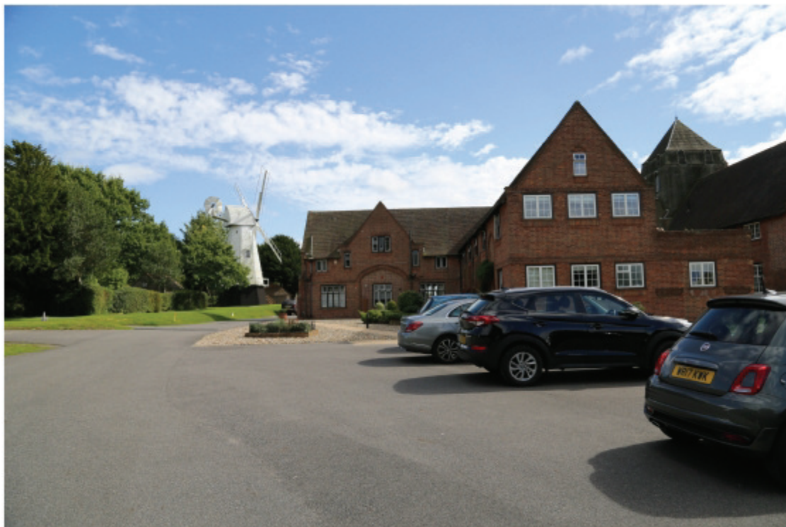
Parking Area with Windmill

St George's is sited on top of a ridge from which there are views across both the South and the North Downs. From within the conservation area itself, views out of the site are fairly restricted due to the hedges and trees of its boundary, which adds to the sense of it being a formalised area within an otherwise more open rural landscape. The St George's building and the nearby windmill dominate the conservation area. The windmill in particular is a highly visible landmark, which can be easily seen from immediately outside the conservation area and from points further away such as Ditchling Beacon.