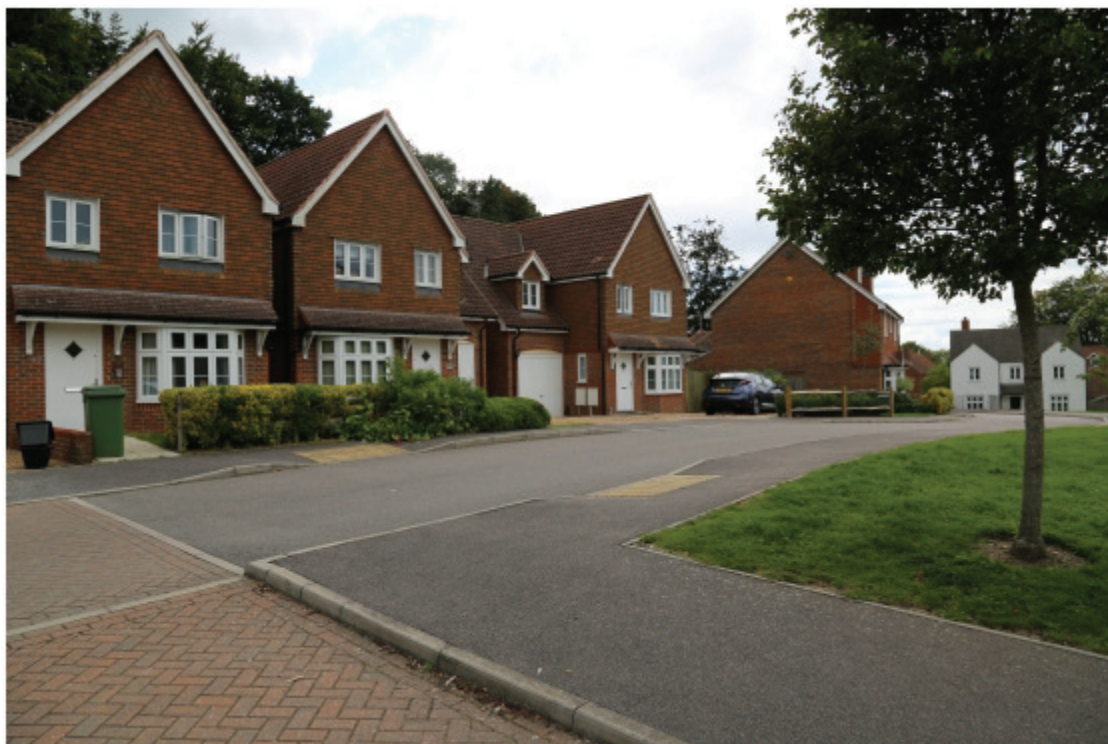
Street Scene at New Heritage