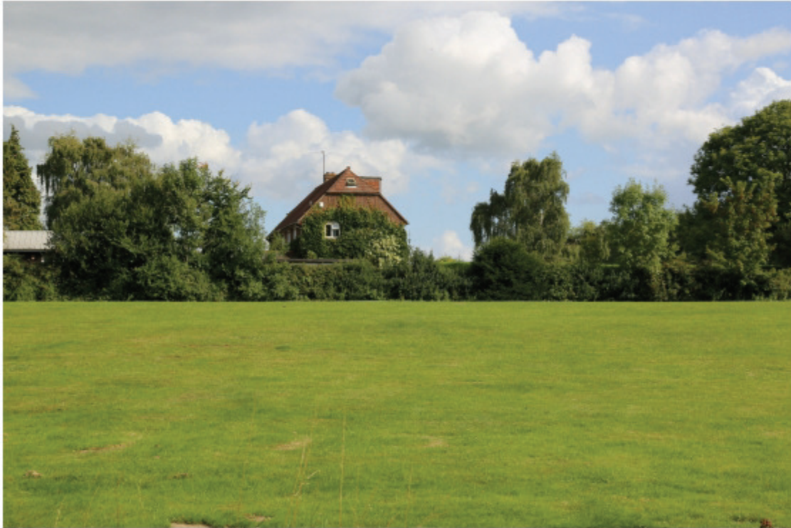
Rowheath Recreation Ground looking South

Although having the appearance of a quiet country lane, in fact Cinder Hill and its northern extension Oxbottom Lane accommodate a variety of residential properties, some of historic importance, being largely hidden from the Lane by hedging or being set back from the Lane and accessible via private driveways.