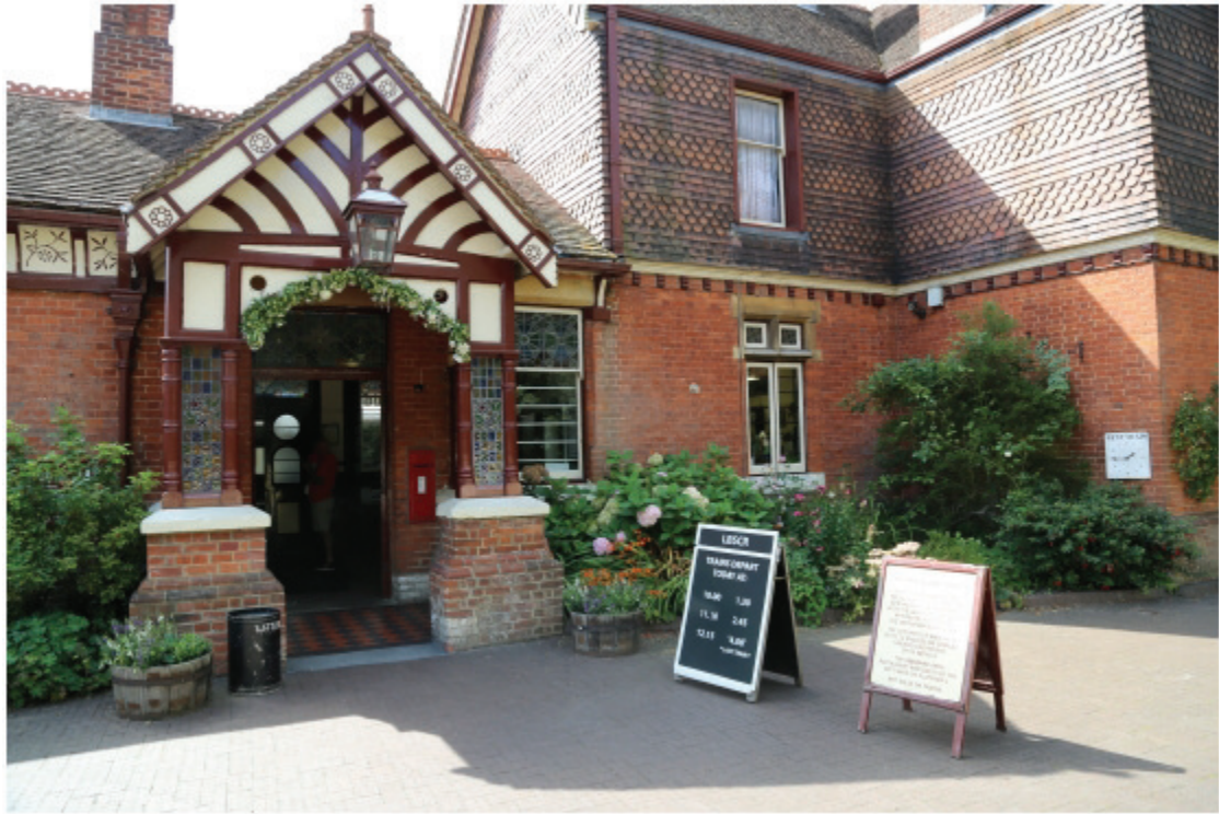
Entrance to Sheffield Park Station on the Bluebell Railway