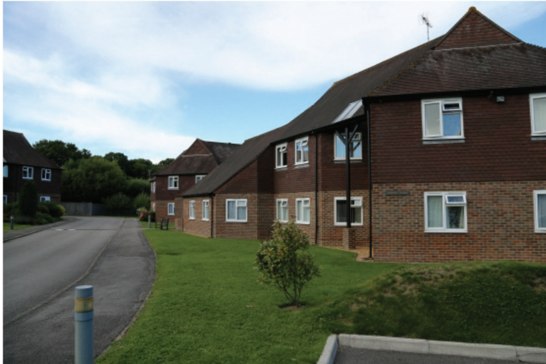
Illustrating variety of Roof Lines at Grantham Close