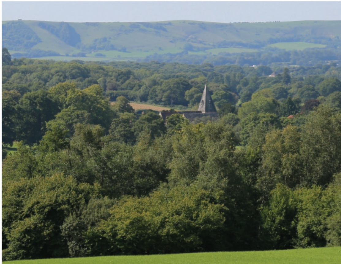
Panorama of Chailey with St Peter's Church

The provision of housing since the 1980s has been dominated by estates, blocks of housing of uniform design carried out by a single developer and based on a design book which might cover the whole country; houses now familiar in Chailey might be just as familiar to residents of Truro or Doncaster, but have little connection to the houses which came before. These developments probably brought more affordable housing to more people than would have been achieved otherwise, but are also the source of most of the current criticism of the quality of our built environment.