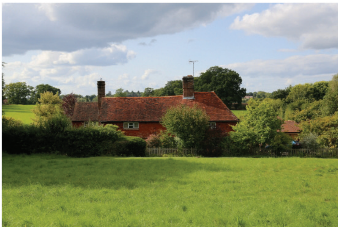
Part of Rowheath looking North

Two very significant properties are the historic Ades Mansion and Roheath, but other properties in the Lane, such as the cottages at Coppard's Bridge, Tompsett's Charity, White Lodge, Keepers, Hickwells and Cinder Farm are also historically important and attract listed status.