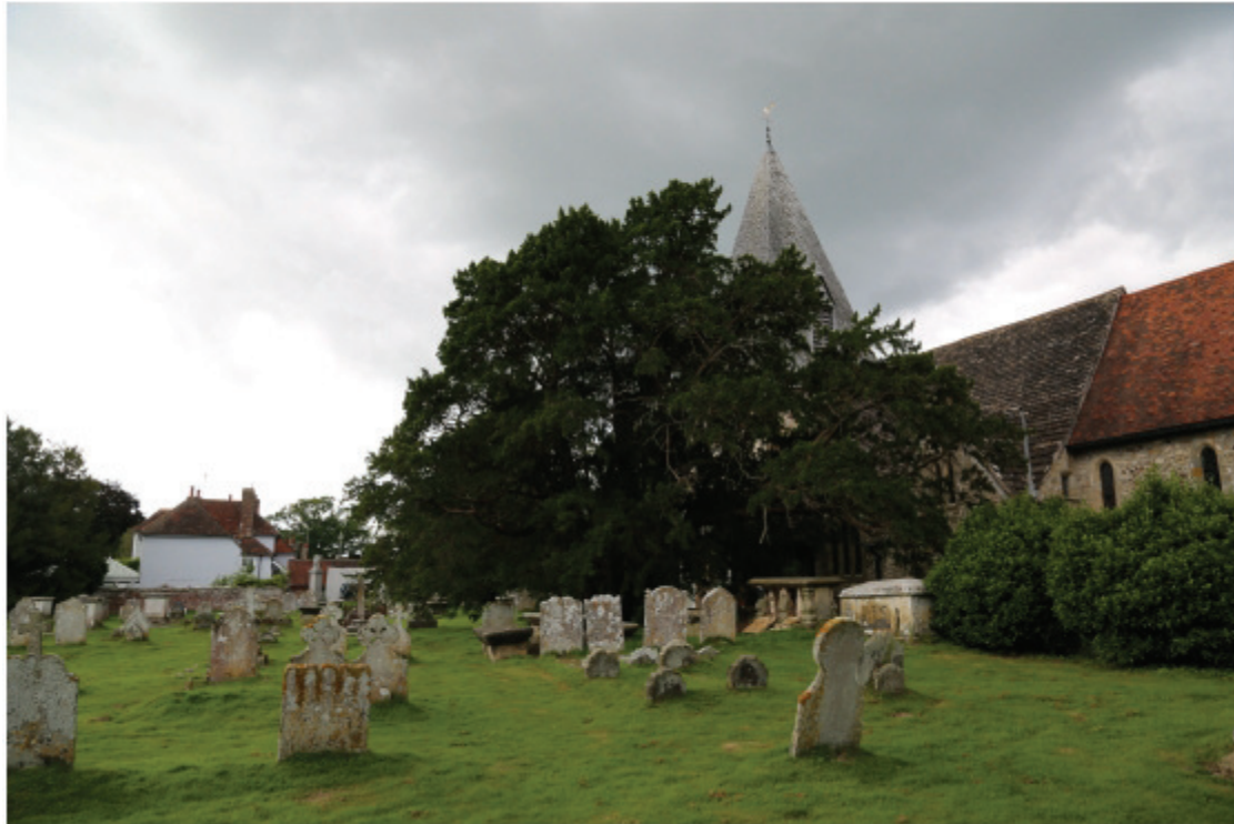
St.Peter's Churchyard, with the ancient yew, said to mark the centre of Sussex

and regions of the Common which spread to East and West. Chailey Green is the centre of this area and formerly housed small businesses: a butcher, a jeweller, a tailor, a smithy and others, but is now a Conservation area centred on St Peter's Church and the Parish Office and Reading Room. Larger houses and farmsteads (many being listed dwellings) from earlier centuries to the present, have developed along lanes to either side of these roads and more specifically in 'closes' - effectively lanes off the central spine of the A-275 and the A-272.