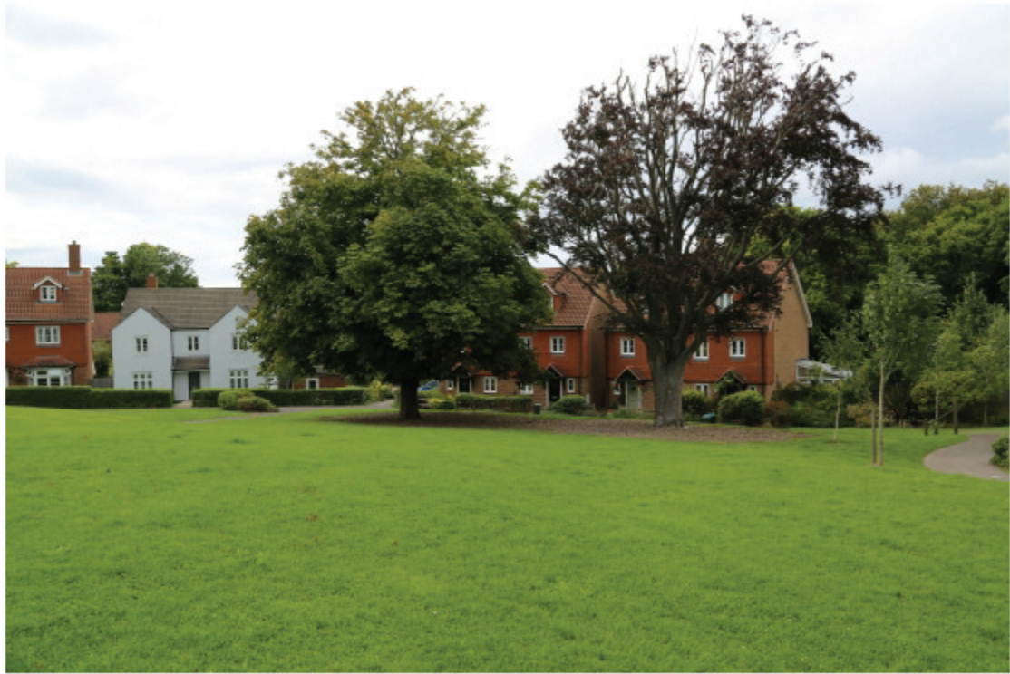
Green at New Heritage