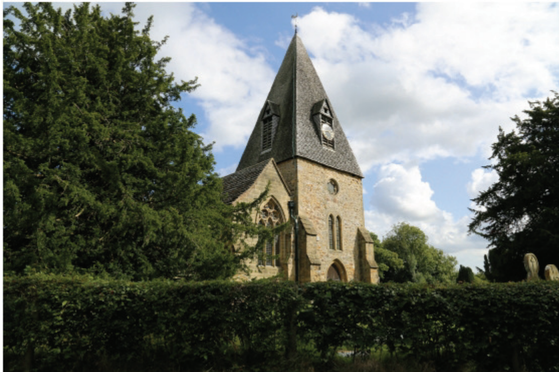
St Peter's 13 th Century Church

comprised of clay, which has historically been used to make bricks, tiles and pottery. This accounts for the prevalence of brick and tiles used in the construction of many of the historic buildings in Chailey Green and the surrounding area.