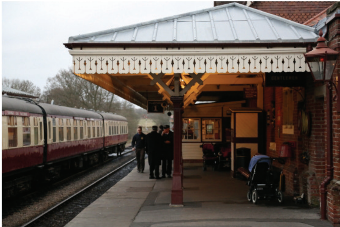
Platform at Sheffield Park Station