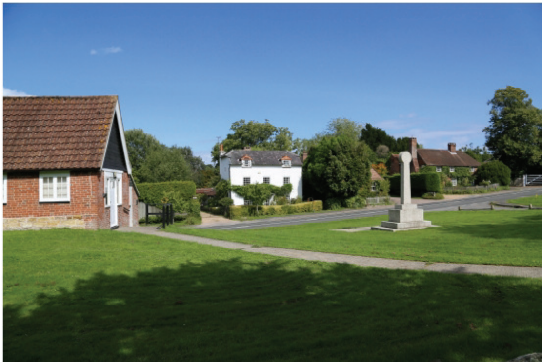
Chailey Green with Reading Room and War Memorial