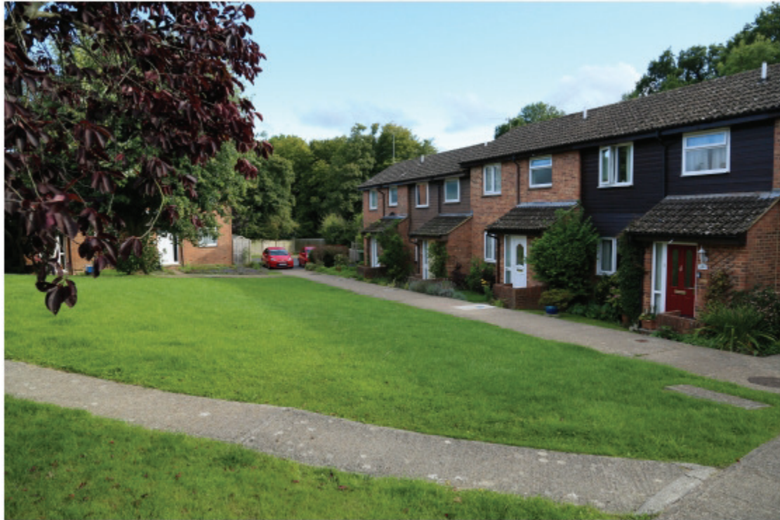
Open Play Area at Whitegates

In summary, this development offers a sustainable, safe and pleasant environment and is one of the main sources of affordable accommodation in the Parish.