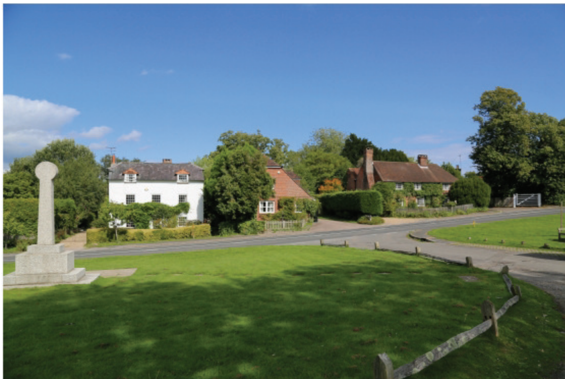
Chailey Green looking East

Notable also is the Reading Room, which, while a small single storey building, which appears to have been altered significantly in its history, is a focal point because it sits prominently on The Green.