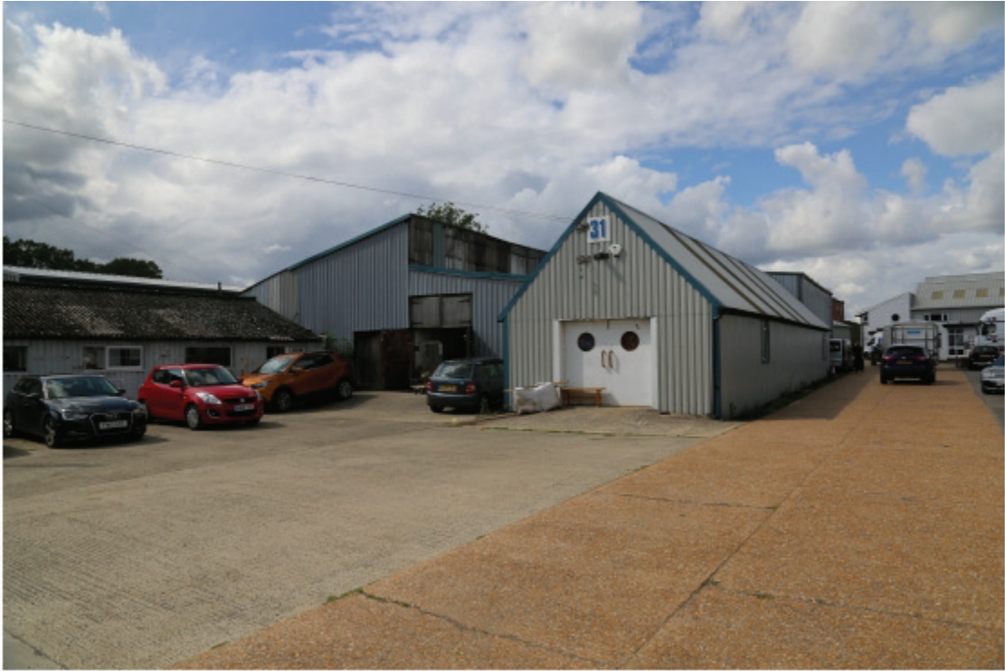
Sheffield Park Business Estate