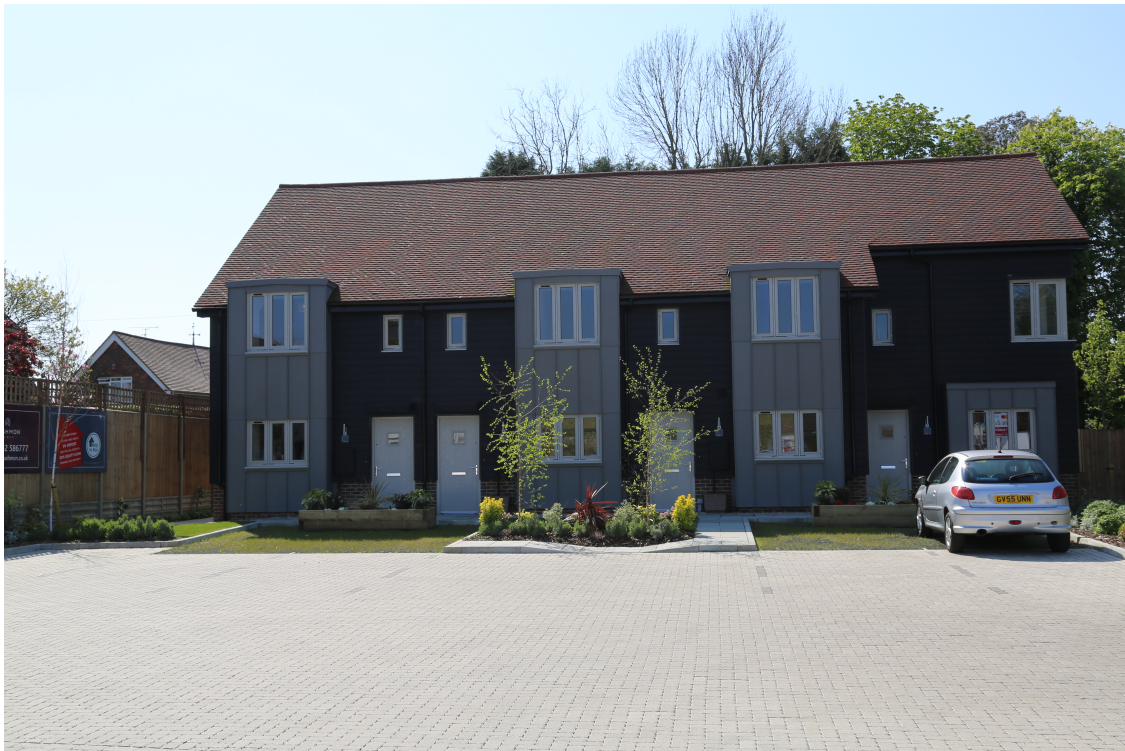
Part of recent King's Head development – a mix of small flats and 2-3 bedroom apartments in the Sussex Barn style

Key Evidence base reference: Historic environment report, Character appraisal, Housing Needs Survey, Shaping Chailey Questionnaire, Local connection eligibility for affordable housing criteria as required by Lewes & Eastbourne