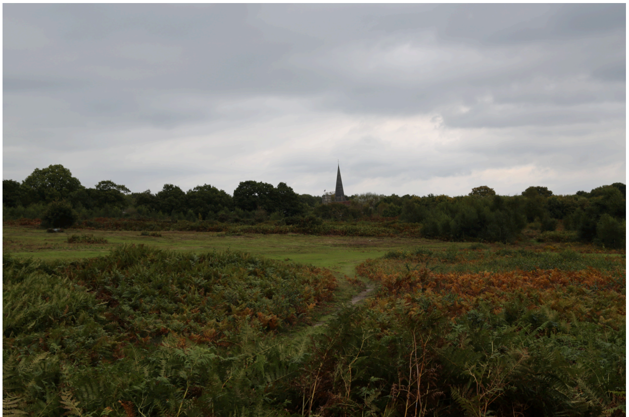
Spire of St Martin's Chapel – part of Chailey Heritage – seen from Romany Ridge, one of the five Commons making up Chailey Common