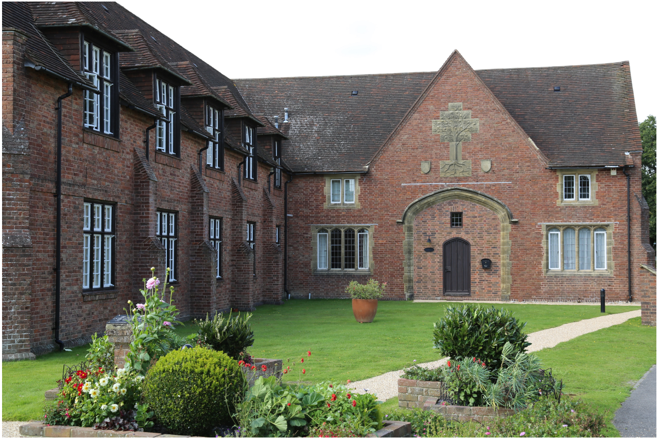
St George's Development (1932) with the Golden Apple Tree relief commemorating the campaign to raise funds to build this part of Chailey Heritage, now converted to 14 flats and maisonettes