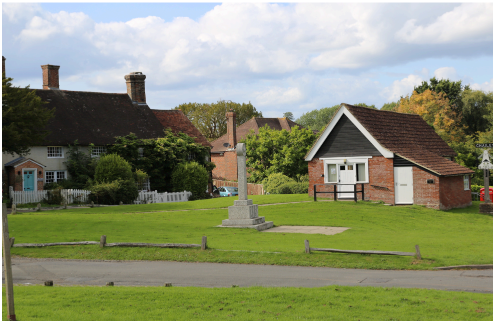
Chailey Green – the centre of the Village

Chailey Green is located within the countryside, 6.5 miles to the north of Lewes. Lewes Road, the A-275, runs through the Conservation Area on the eastern boundary of the Green. Several narrow dead-end lanes run around and off the Green and A-275. The road which we now know as the A-275 was uprated to become a turnpike in the late 18th century, and was re-routed to avoid passing through the grounds of Chailey Place. The area has a distinct identity because it is one of the few nucleated historic settlements within Chailey. Despite being within the open countryside, the conservation area has a pervading sense of enclosure, almost separateness, provided by the concentration of buildings that surround The Green. Nevertheless, the rural setting is an integral part of the character of the conservation area, with views across open fields possible in several locations.