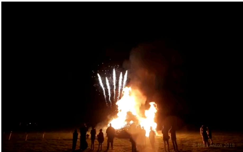
Annual Chailey Bonfire Celebration

Key Evidence base reference: Survey, The Assets of Community Value (England) Regulations 2