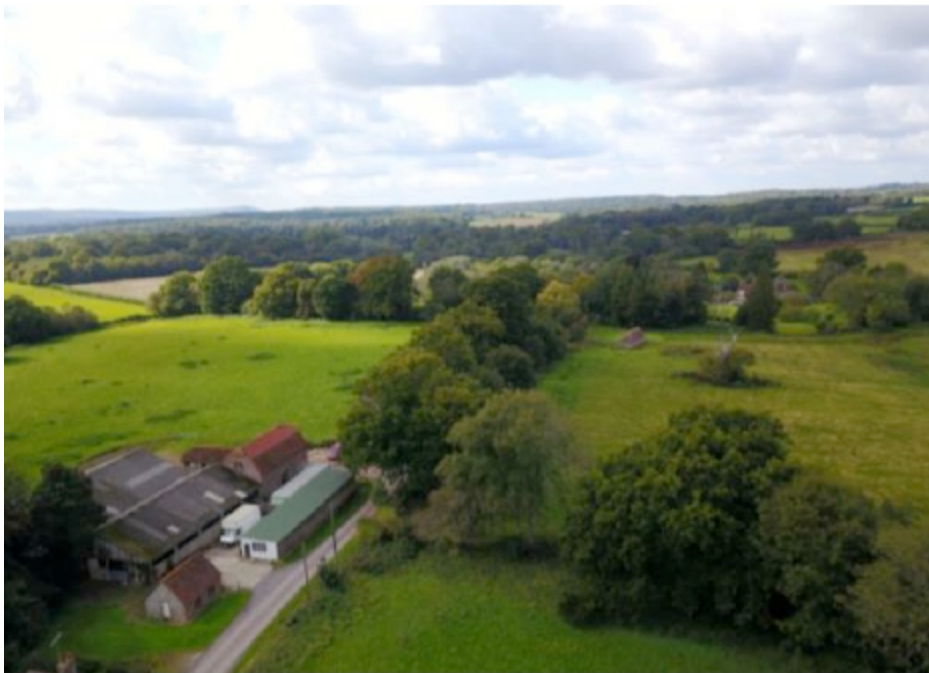
East of Chailey Green towards The Moat

To the East of Chailey Green, the historic centre of the village extends westwards towards Cinder Hill and Cornwells Bank. This area features many of the most historic properties in the Parish including Ades, Roeheath, Tompsett's Charity, Cinder Farm and Markstakes Farm. Ades Lake on Cinder Hill was as a fish pond for the Grange on the site which, in medieval times, was owned by Chertsey Priory – the eleven (until recently twelve) ancient and protected willow trees on the earth dam represented the apostles.