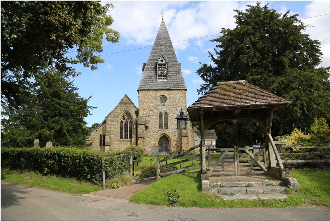
Chailey Church and Lychgate