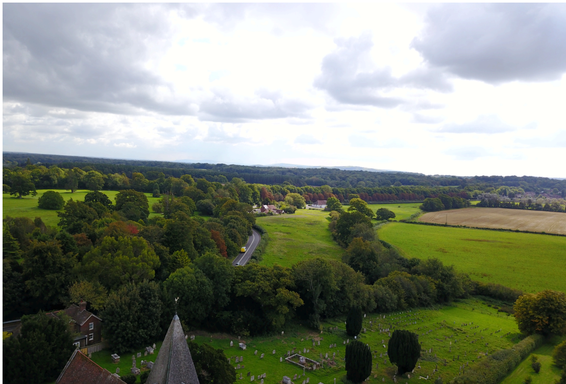
Vista of Chailey between The Green and South Common