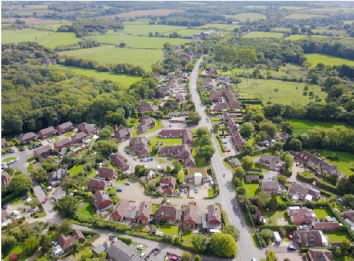
Panorama of South Common settlement looking South – note the pattern of Closes which lie off the main A-275 highway