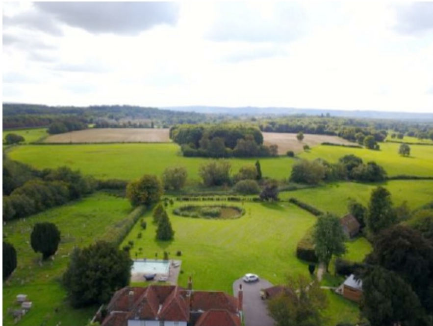
South from St Peter's Church

In more recent years, tourism has become a significant industry in Chailey, fuelled by significant tourist attractions such as the Bluebell Railway and Sheffield Park. Campsites such as the Wowo Campsite offers family camping facilities along with shepherds huts and yurts and several holiday lets are now in operation, some of them offering specialist facilities.