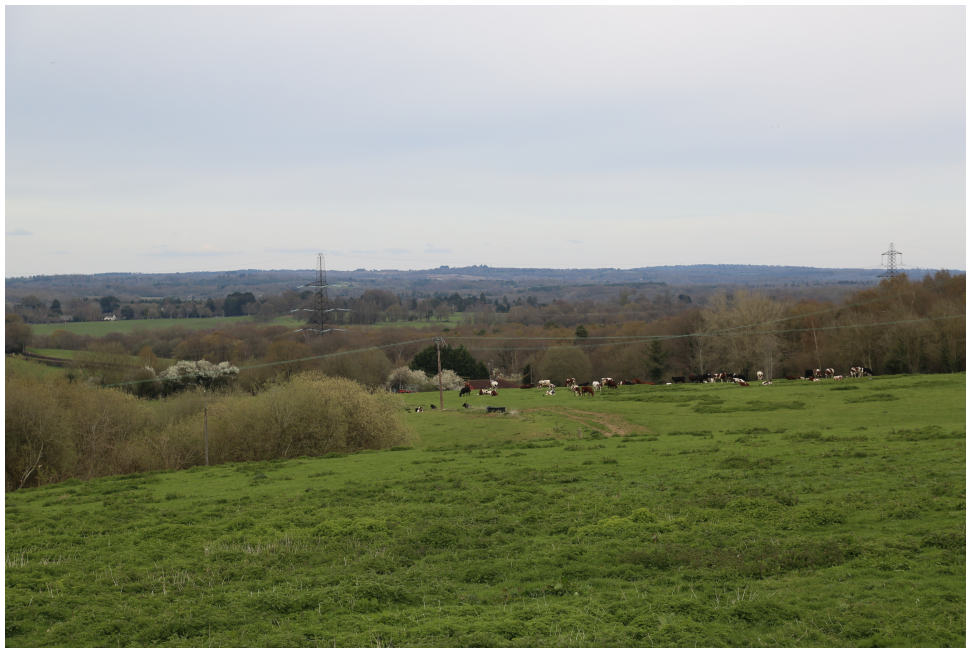
Farmland to the North across the Ouse valley and on to the Ashdown Forest

Key Evidence base reference: Survey, national guidance from Natural England, Natural England website SSSI Mapping System impact risk zone