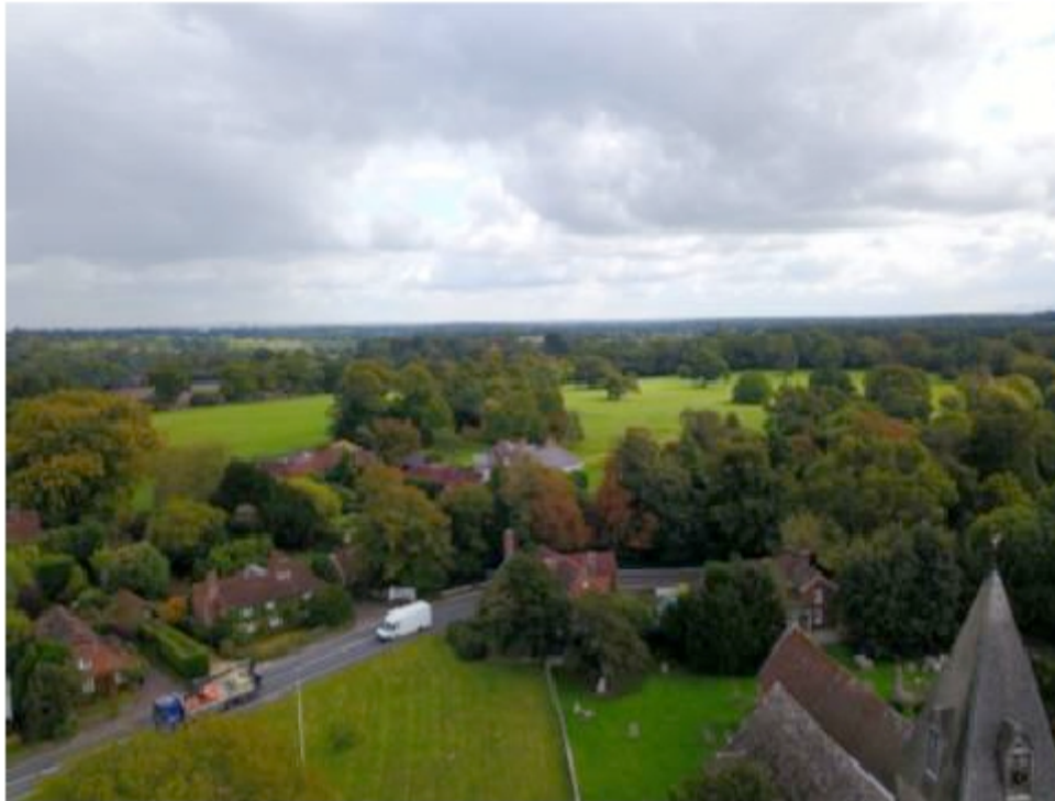
South West from Chaily Green