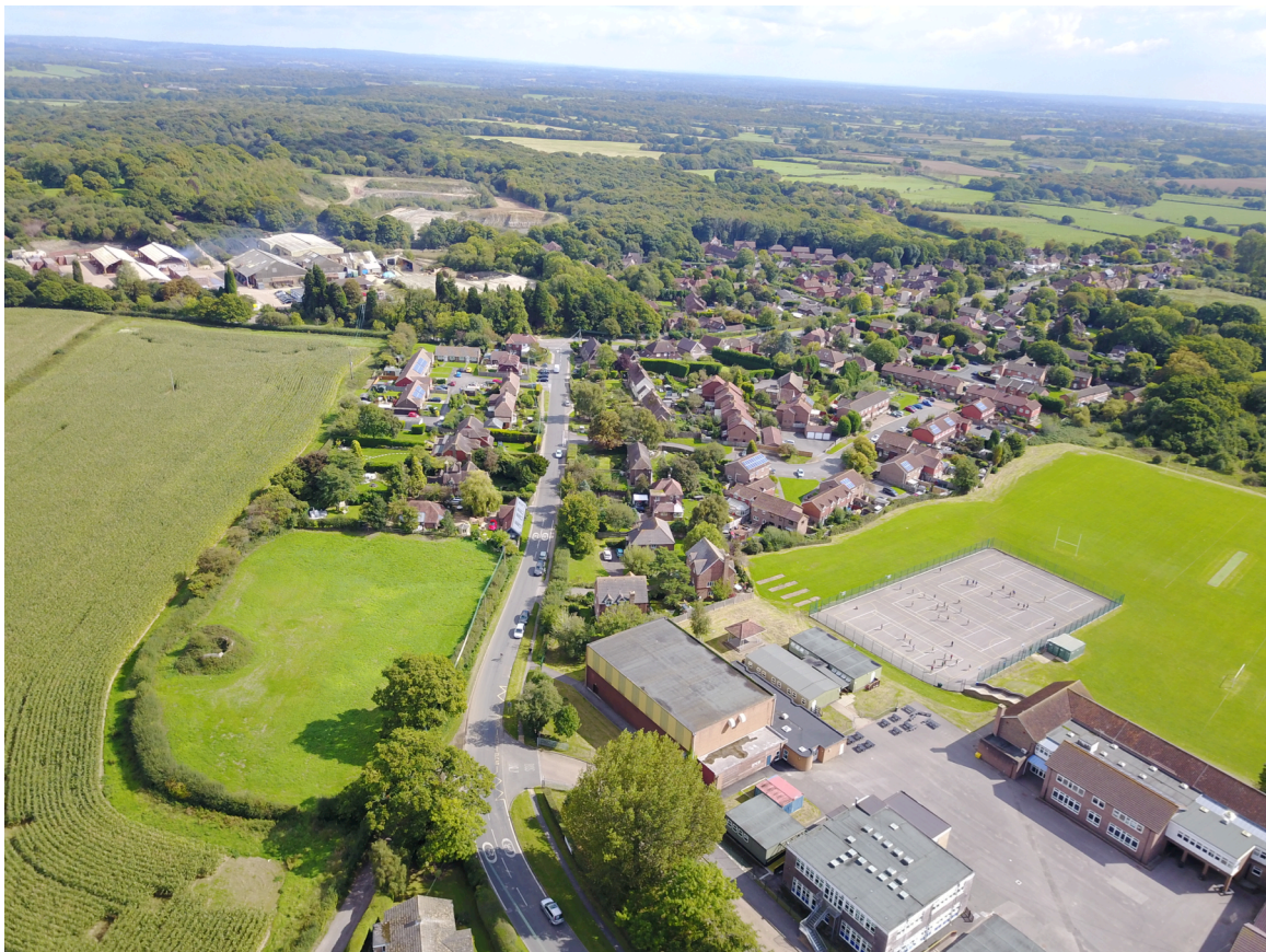
Mill Lane, South Common, showing Chailey Secondary School and the Brick Works beyond