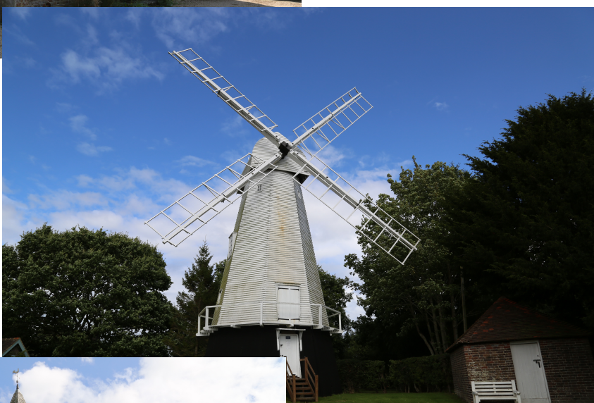
Chailey Mill – the geographical centre of Sussex