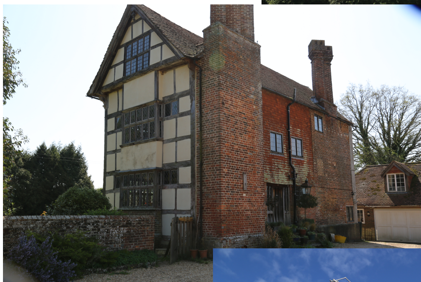
Wapsbourne Manor Farmhouse – late 16 th C.