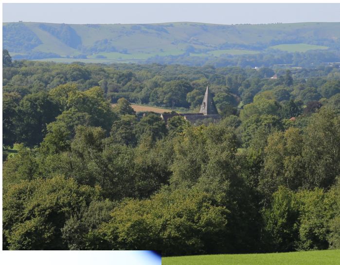
Vista to the Downs from above Roeheath across the village centre