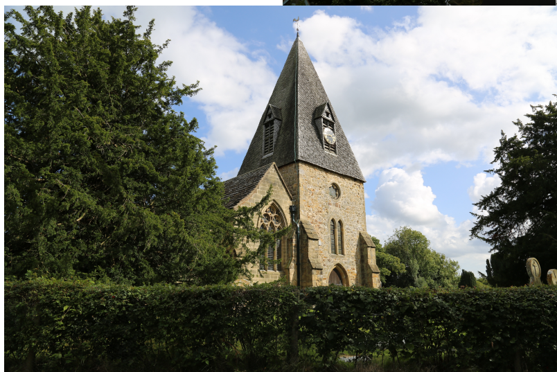
Tower of St Peter's Church at Chailey Green. 13 th Century