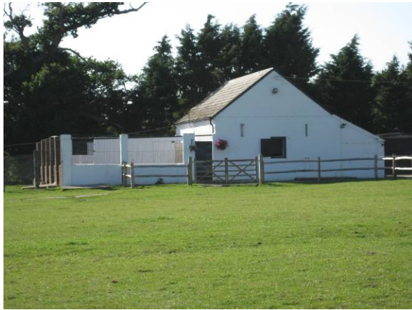
Barracks magazine (now hunt kennels)