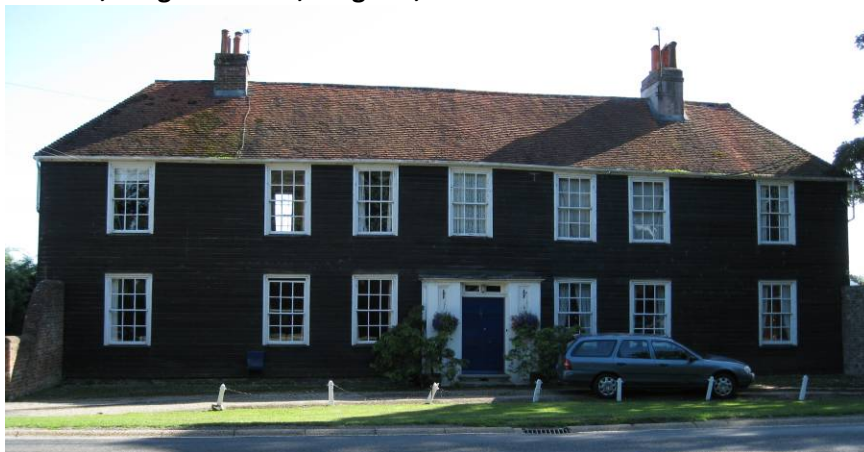
Officers' Quarters (listed)