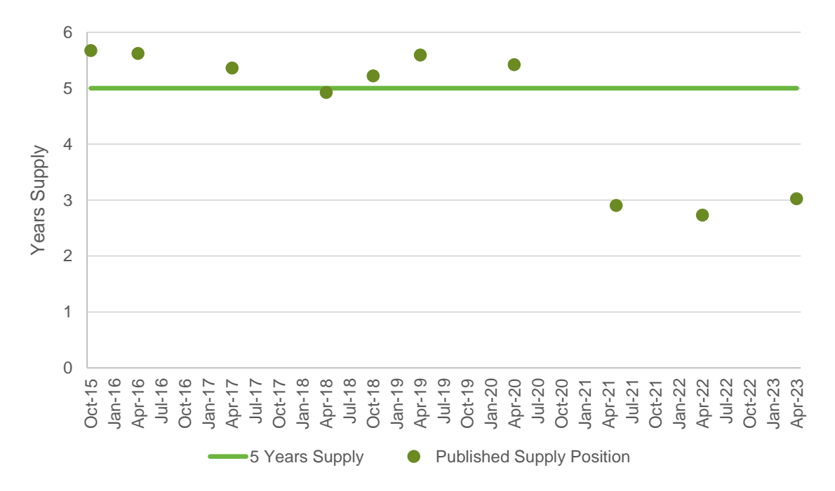
Figure 1 - Five Year Supply since adoption of LPP1