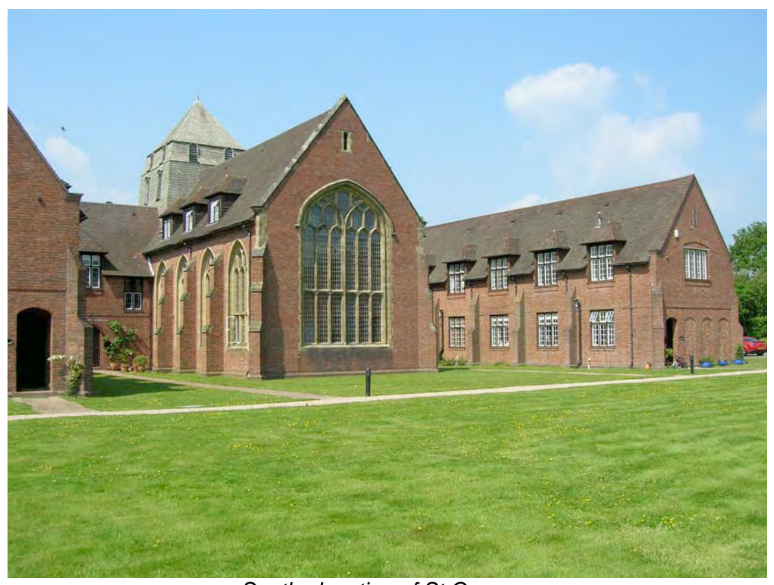
South elevation of St Georges

A request was made to the Department of the Environment in the mid 1990s to consider adding St George's to the statutory list, but English Heritage considered that the building is not of sufficient architectural or historic interest to qualify for inclusion. However, St George's may merit being included on Lewes District Council's list of Buildings of Local Interest due to its prominence, attractive architecture, interesting details and its social historical associations.