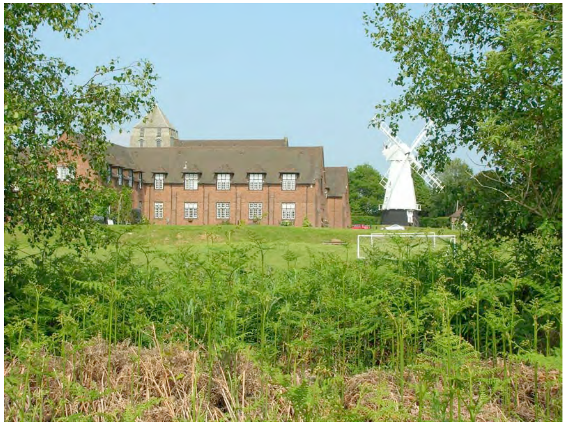
St George's and the Windmill, viewed from the footpath to the west