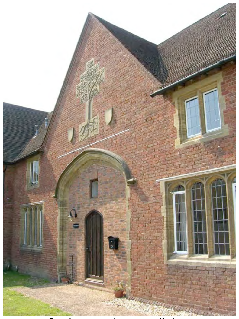
Sandstone apple tree motif above the former entrance archway

hung on a tree outside the school chapel. This provides a sense of the building's history and origins. To either side of the apple tree detail there are two sandstone shields. Originally these were decorated with the shields of the See of Chichester and the See of London, representing the two Dioceses mainly connected with the school.