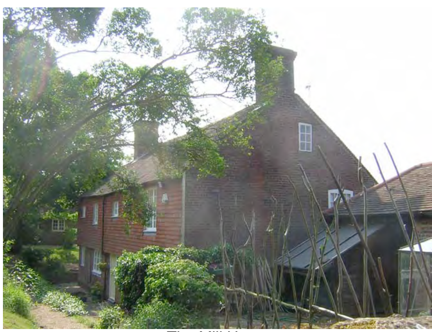
The Mill House

The Barn is built in random coursed sandstone with brick quoins and window surrounds. There is a brick stringcourse at eaves level on the west elevation of the building. The roof is half-hipped and tiled.