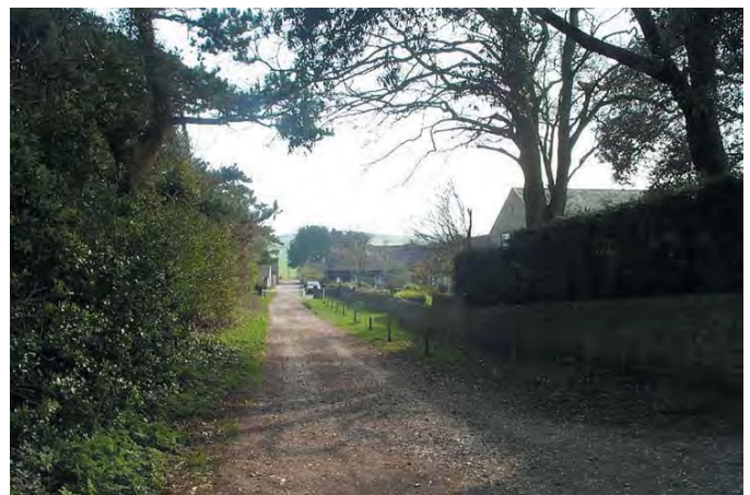
Chyngton Lane (looking south towards conservation area)

The Conservation Area retains the character of a downland hamlet notwithstanding that modern residential development abuts its western and northern boundaries. The north of the conservation area features trees lining the lane, some of which are protected by tree preservation orders and this gives the narrow lane a leafy rural feel.