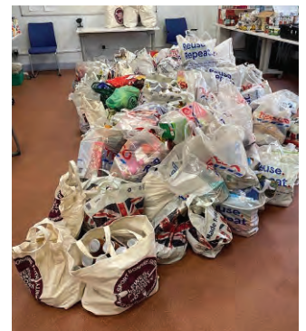
Food collected from Lewes supermarkets on 11 December 2021.

Demand has continued to grow, but thanks to a dedicated team of volunteers who mostly live on the estate, we have been able to rise to the challenge. You can help us and your community by donating fresh food or other supplies at the Foodbank in Horsfield Road on Mondays between 10am and 1pm. Please note that all our clients at Landport Foodbank are referred to us by a professional agency.