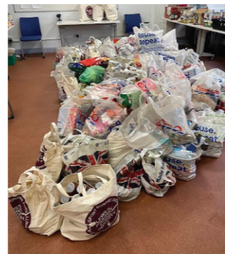
Food collected from Lewes supermarkets on 11 December 2021.

The Foodbank is currently feeding 136 individuals made up of 55 households (27 families / 28 singles and couples). Demand has continued to grow, but thanks to a dedicated team of volunteers who mostly live on the estate, we have been able to rise to the challenge. You can help us and your community by donating fresh food or other supplies at the Foodbank in Horsfield Road on Mondays between 10am and 1pm. Please note that all our clients at Landport Foodbank are referred to us by a professional agency.