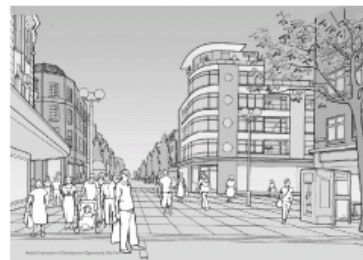
Artist's Impression of Development Site Five