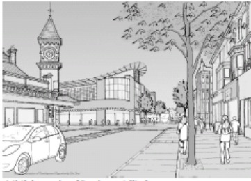
Artist's Impression of Development Site One