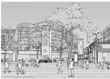
Artist's Impression of Development Site Four