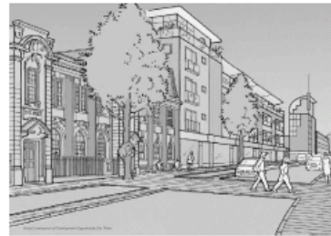
Artist's Impression of Development Site Three