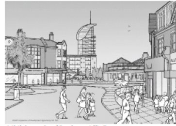
Artist's Impression of Development Site Two